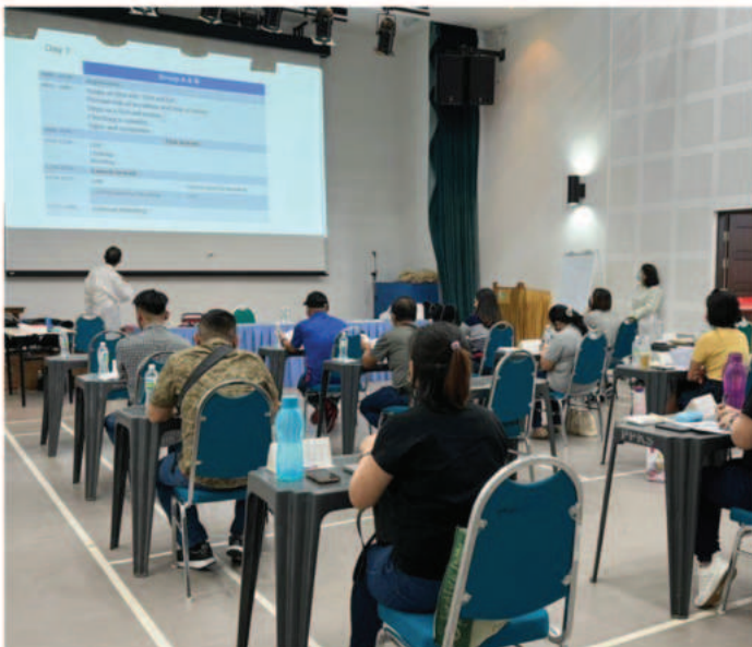
Basic First Aid & CPR (20 - 30 November 2022)