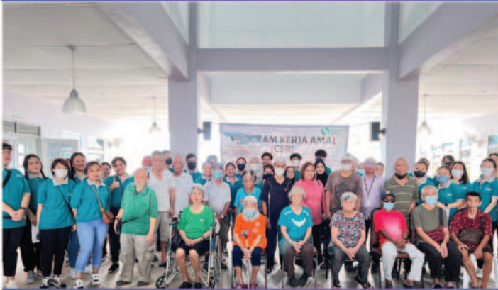
Corporate Social Responsibility (CSR) with the Elderly at Rumah Seri Kenangan Organized by Students from Office Administration Supervision Programme (February & August 2022 Intakes). (31 October 2022)