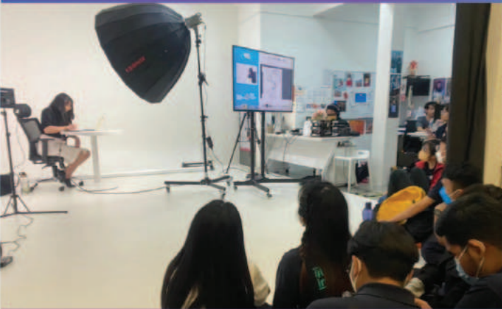
Samarahan Digital Festival. Sarawak Skills' Graphic Design Students (Level 3) Attended the Digital Sketching Demo. (11 November 2022)