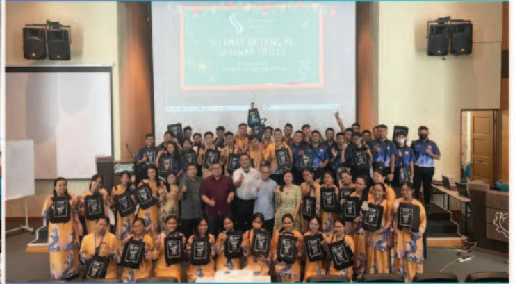
Study Visit by SMK Datuk Patinggi Kedit, Betong to Sarawak Skills. (11 November 2022)