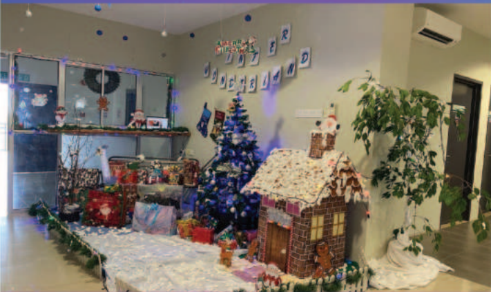
SRSC Christmas Decoration Competition. (8 December 2022)