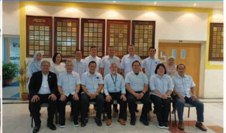
Benchmarking Visit by the Sarawak Skills Management Team to the Penang Skills Development Centre (PSDC) (30 November 2022)