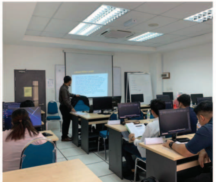
AutoCAD Level 2 (29 November - 1 December 2022)