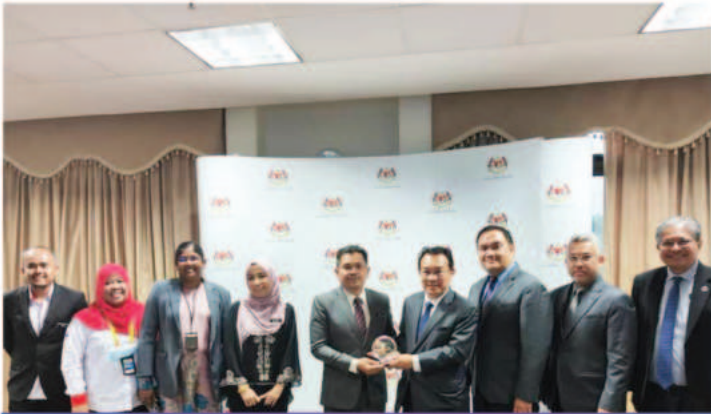
Meeting at the Ministry of Human Resources (MOHR), Putrajaya. (18 October 2022)