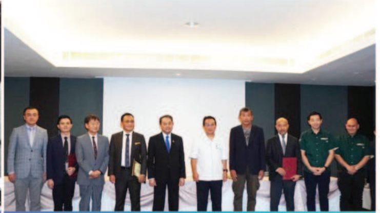
Memorandum of Understanding Signing Ceremony Between PPKS ILMU Sdn Bhd (i-CATS University College) and Asia China Education and Culture Association (ACEC), Farley Mall Sdn Bhd and KTT Sdn Bhd. (17 October 2022)