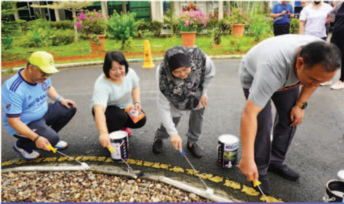
Gotong-royong Activities in Conjunction with Quality Environment Audit (5S). (5 October 2022)