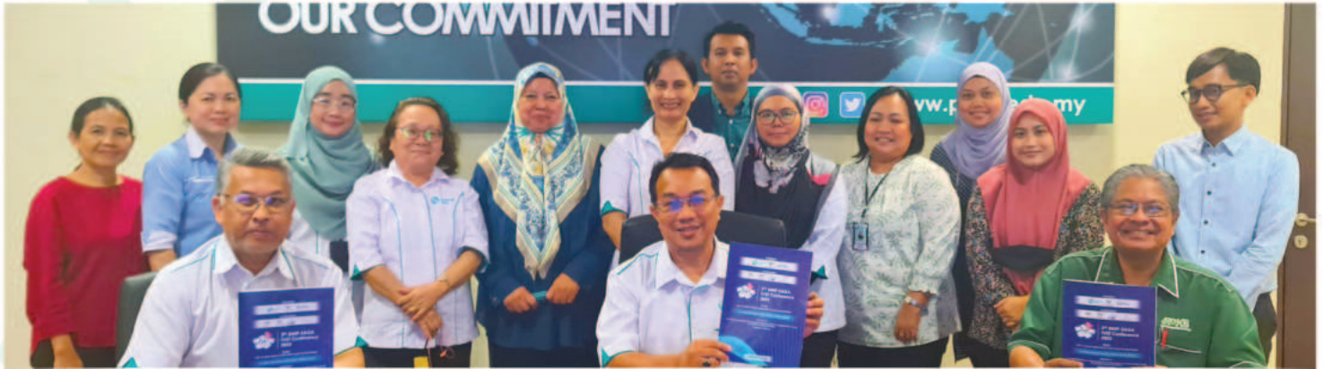
Group Photo: Taken after the conference internal working committee meeting on 21 November 2022.

The 3 rd BIMP-EAGA TVET Conference 2023 will be held in Kuching on 8 and 9 March 2023.