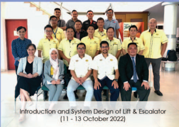
Introduction and System Design of Lift & Escalator (11 - 13 October 2022)