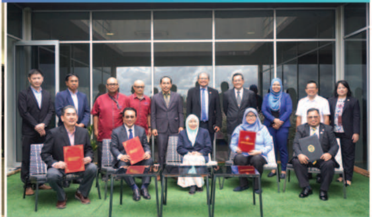
Memoranda of Understanding Exchange Ceremony Between Sarawak Skills and UNIKL, UNIMAS and Walta Engineering Sdn Bhd at Sarawak Skills. (14 December 2022)