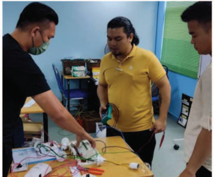
Basic Electrical Installation (1 - 3 November 2022)