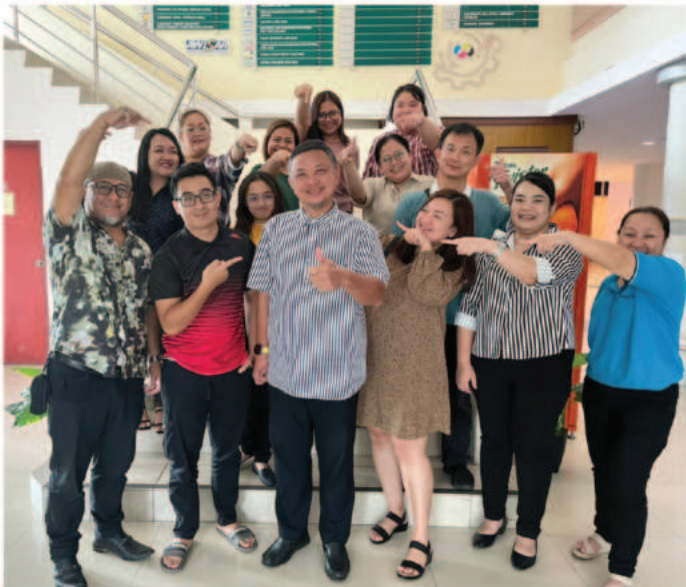
Microsoft Excel (Basic & Intermediate) (11 - 13 October 2022)