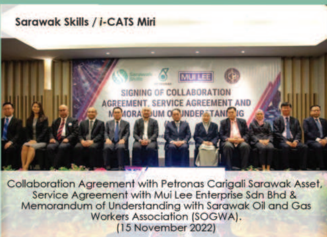
Sarawak Skills / i-CATS Miri