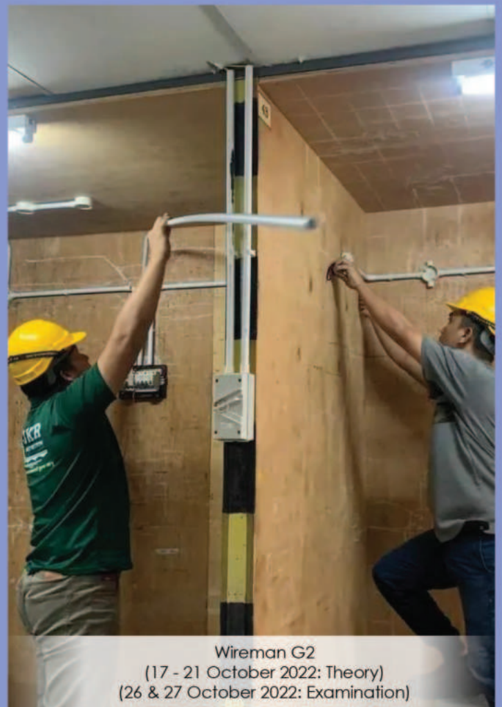
Wireman G2 (17 - 21 October 2022: Theory) (26 & 27 October 2022: Examination)