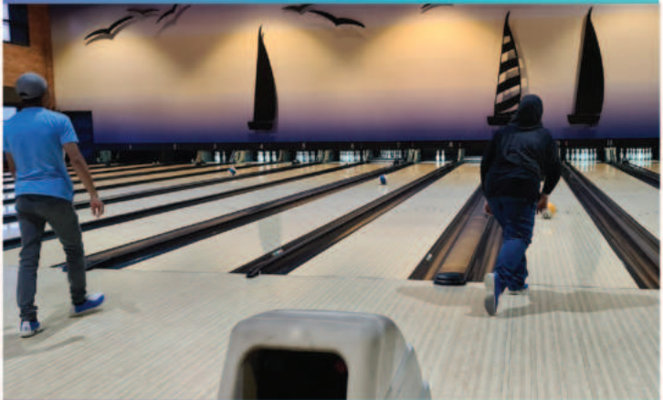
Bowling Competition Organized by Sarawak Skills Social Recreational and Sports Club (SRSC) at Megalanes, Batu Kawa. (11 November 2022)