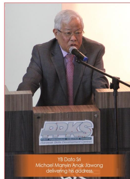
YB Dato Sri Michael Manyin Anak Jawong delivering his address.