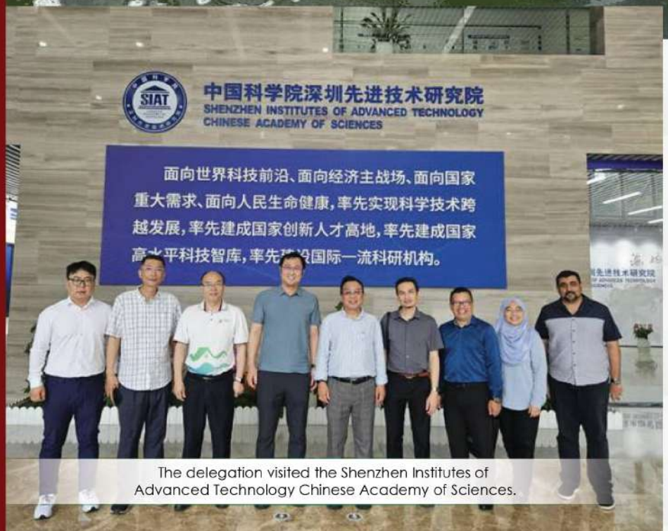
The delegation visited the Shenzhen Institutes of Advanced Technology Chinese Academy of Sciences.

The farm is the result of collaborative research between Nanjing Agricultural University and leading agricultural companies. This research is applied directly to farming practices, helping farmers enhance their productivity and adopt more sustainable methods.