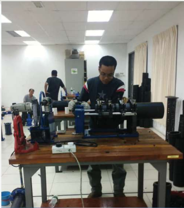
Mains Layer (21-25 April 2025)