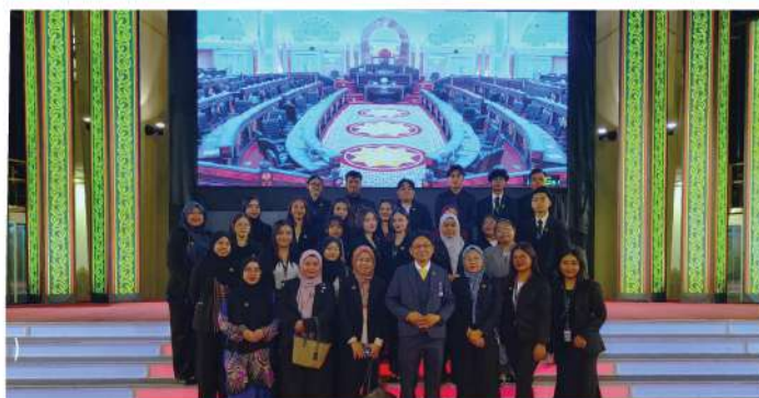
A total of 29 Staff and Students from Sarawak Skills Received an Invitation from the Office of the Deputy Premier of Sarawak to Visit the Sarawak State Legislative Assembly (DUN) in Conjunction with the First Meeting of the Fourth Session of the 19 th Sarawak State Legislative Assembly. (26 May 2025)