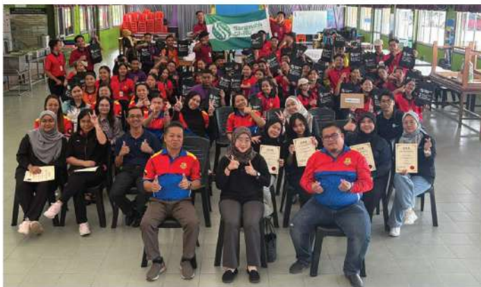
SMK Datuk Patinggi Kedit, Betong Student Leaders Empowerment Programme in Collaboration with Sarawak Skills. (8-10 May 2025)