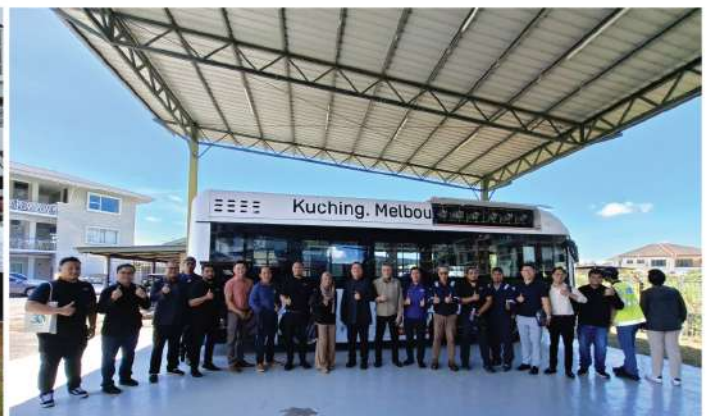
Officials from SIB Mili Sdn. Bhd. Visited Sarawak Skills, Tabuan Jaya, Kuching. (23 April 2025)