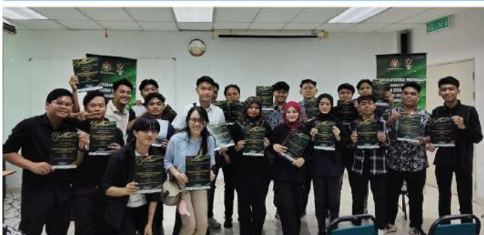
A Total of 20 Sarawak Skills Students from Various Courses Attended the Economic Empowerment Intervention Programme (PIPE), Sarawak State-Level Hydroponic Cultivation Programme 2025, Organized by the Sarawak State Department of Youth and Sports at the Sarawak State Youth and Sports Complex . (24-25 June 2025)