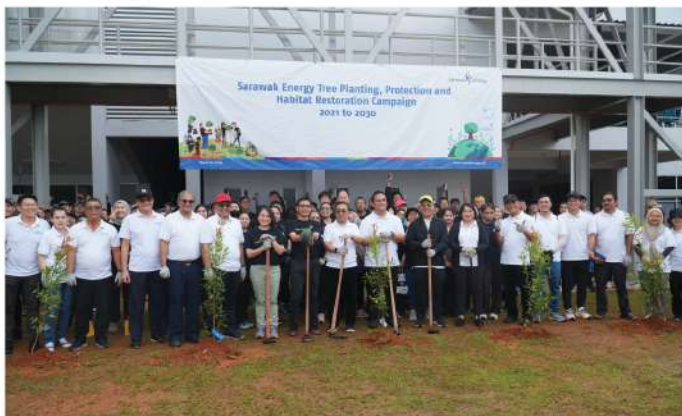
Campus in a Garden Tree Planting Programme. A Collaboration Between Sarawak Energy & Sarawak Skills. (17 April 2025)