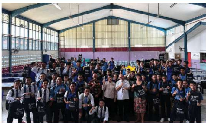
TVET Roadshow at SMK Song, Kapit. (16 May 2025)