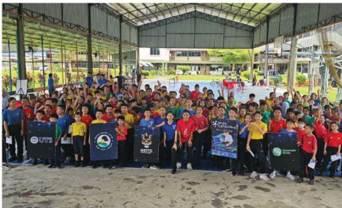
STEM Catalysts Raspberry Pi 2025 Programme at SJK Chung Hua Lundu. (15 May 2025)