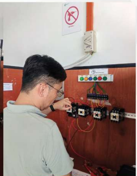
Chargeman L1 (19-21 May 2025)