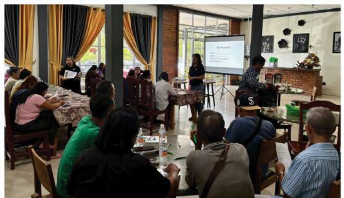
Paddy Cultivation Project - Theory Session at Tawang Baa, Padawan. (19-22 May 2025)