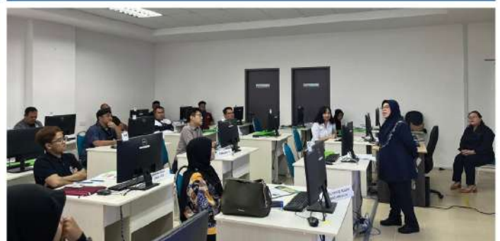
Implementation of the 2025 Rural ICT Training & Development Programme for the Sustainable Modern Agriculture Through Rural Technopreneurship (SMART) Course, Organized by the Ministry of Food Industry, Commodity and Regional Development Sarawak (M-FICORD). (16 June 2025)