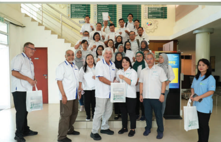
TVET Cloud LMS and Digital Contents Training Programme. (24 June 2024)