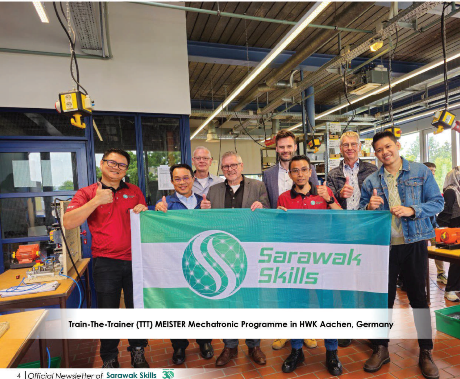
Train-The-Trainer (TTT) MEISTER Mechatronic Programme in HWK Aachen, Germany