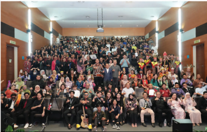
Student Assembly: Teacher's Day Celebration in Sarawak Skills. (17 May 2024)