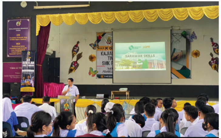
Skill Career Opportunity Talk 2024 at SMK Pending. (3 May 2024)