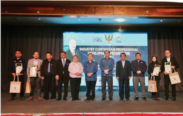
Industry Continuous Professional Development Programme (iCPD) In Miri. (3 May 2024)