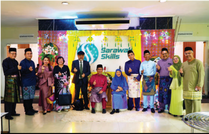
Sarawak Skills "Bejarah Raya Aidilfitri". (24 April 2024)