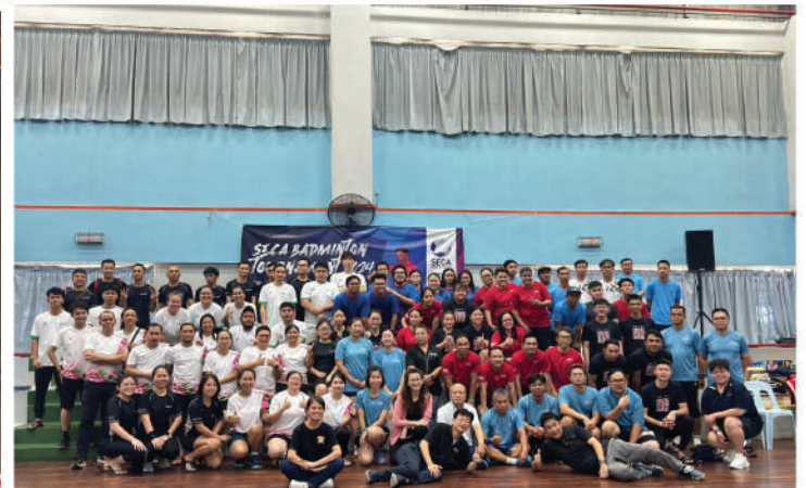
SECA Badminton Tournament. (4 May 2024)