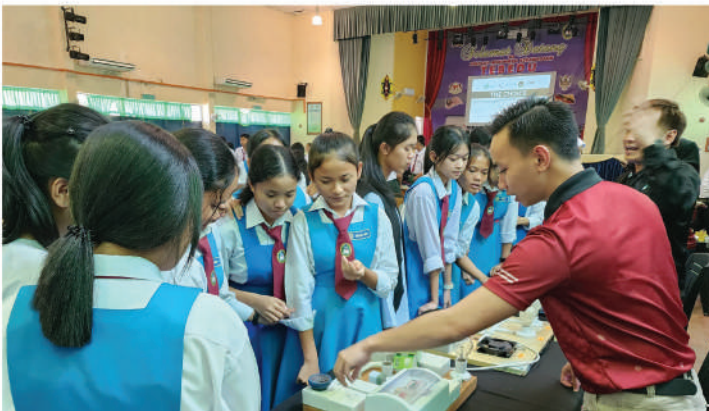
"The Choice" Education Programme Co-organized by Sarawak Skills, Sarawak Electronics and Supporting Industries Companies Association (SECA), i-CATS University College and SMK Tebedu. (11 June 2024)