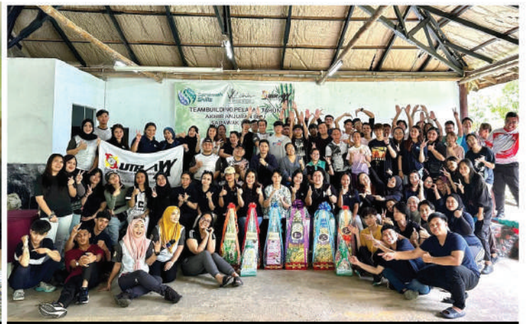
Team Building: Student Development Unit (SDU) with Final Year Students. (24 April 2024)