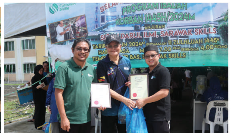
"Ibadah Korban 1445H/2024M" Programme Organized by Surau Darul Ilmi, Sarawak Skills. (18 June 2024)