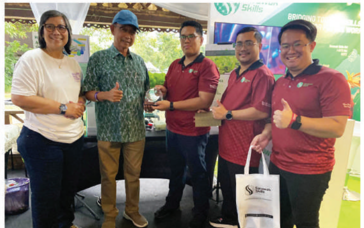
Sarawak Skills Green Ruai Booth in Collaboration with Sarawak Tourism Board During the Rainforest World Music Festival 2024. (28 - 30 June 2024)