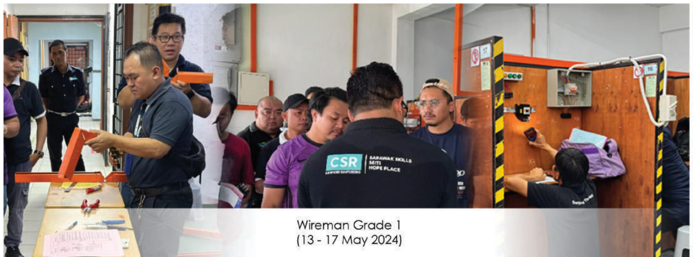
Wireman Grade 1 (13 - 17 May 2024)