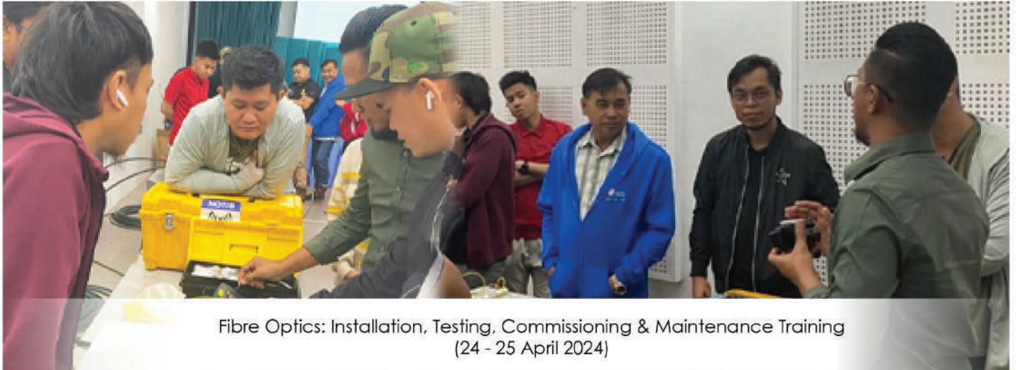
Fibre Optics: Installation, Testing, Commissioning & Maintenance Training (24 - 25 April 2024)