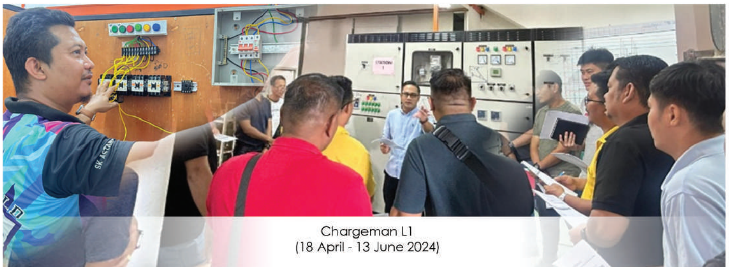
Chargeman L1 (18 April - 13 June 2024)