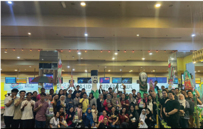
Bowling Competition 2024 Organized by Student Services Unit, Sarawak Skills. (26 April 2024)