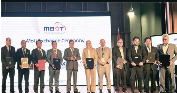
Memorandum of Understanding (MoU) Between Malaysia Board of Technologists (MBOT), Persatuan Juruteknik & Juruteknologis Profesional Kuching (APIT), Sarawak Skills and i-CATS UC.