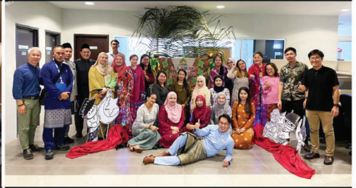
Social Recreational and Sports Club (SRSC) Organized the Raya Decoration Competition.