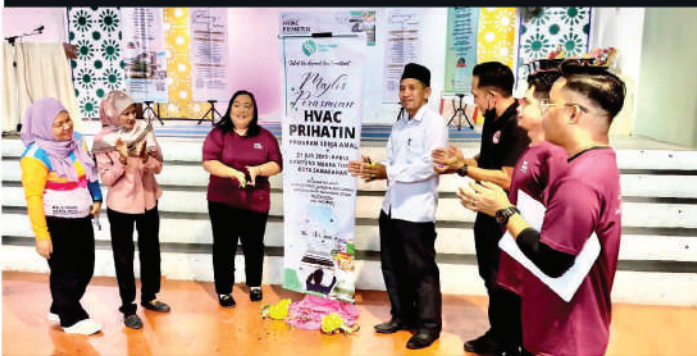
Opening Ceremony of the HVAC PRIHATIN Charity Work Programme Organized by Air Conditioning Course Level 3 in Collaboration with JKK Kampung Muara Tuang.