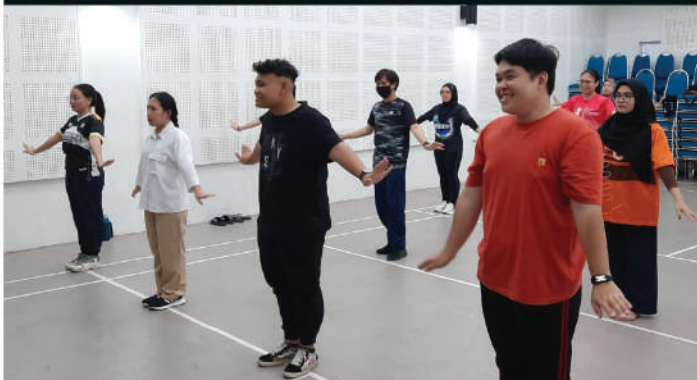
Tai Chi Exercise Activity Organized by the Student Services Department in Collaboration with the Faculty of Sports Science and Recreation Uitm Samarahan for the "Jom Sihat Program".