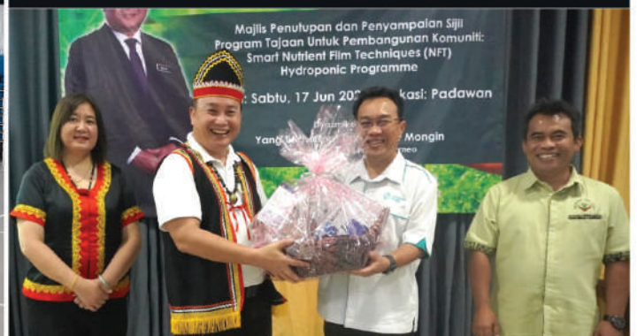
The Closing Ceremony and Certificate Presentation for the Smart Nutrient Film Techniques (NFT) Community Development Programme Organized by Sarawak Skills in Collaboration with Hasanah Foundation.