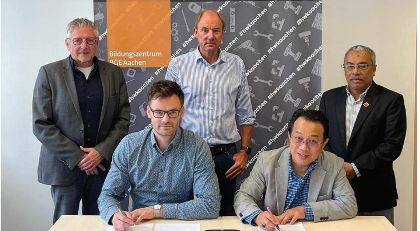
24 May 2023 : Signing of MoU between FMSDC and HWK Aachen, Germany.

The signing of the Memorandum of Understanding (MoU) formalized the renewal of ongoing strategic initiatives, and marks the long-established relationship between the two organizations in enhancing the quality of trainers through the Train-the-Trainer (TTT) Programme for MEISTER and Expert Craftsman training programmes in the various subject areas (Mechatronic, Machining and Automotive) for the FMSDC.