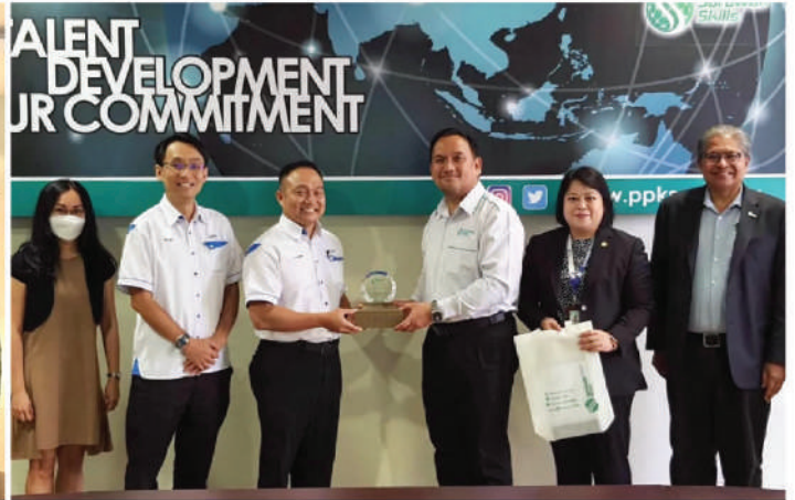
Sarawak Skills Welcomes Officials from the Association of Professional Technicians and Technologists (APT).