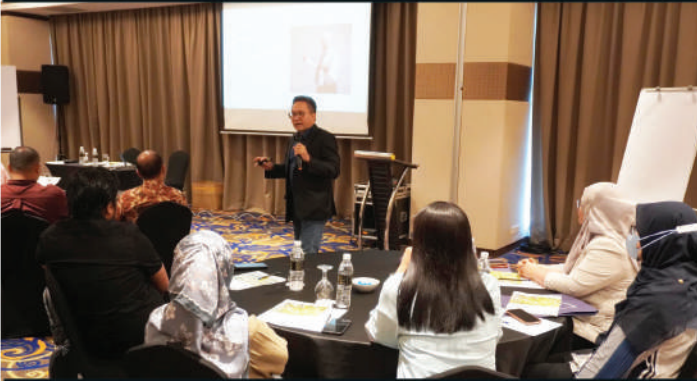
Sustainability & ESG 101 Workshop.