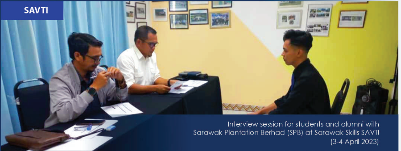
Interview session for students and alumni with Sarawak Plantation Berhad (SPB) at Sarawak Skills SAVTI (3-4 April 2023)