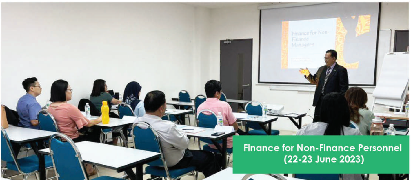
Finance for Non-Finance Personnel (22-23 June 2023)