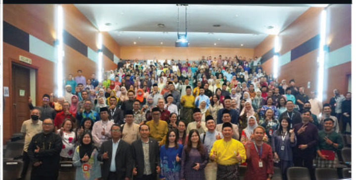
Amanat Executive Director (ED) for 2023 and "Berambah Raya Aidilfitri" at Sarawak Skills.