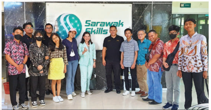
Visit by SMK Karya Bangsa Sintang to Sarawak Skills.