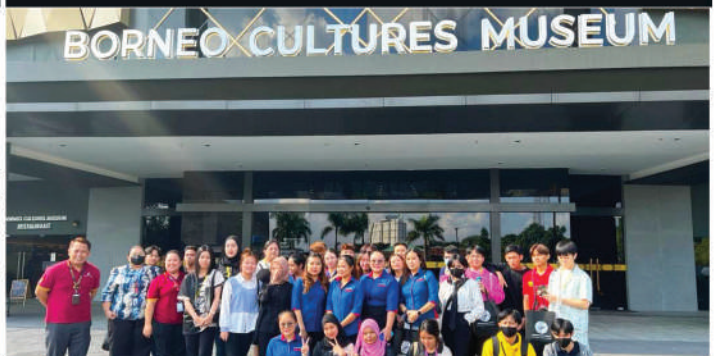
Sarawak Skills Students Attended the Programme "Museum of the Moon" Invitation from the Sarawak Museum Department.