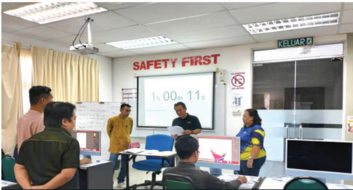
Preparation for Preliminary WorldSkills Malaysia Youth Competition (WSMB) in Graphic Design Technology Represented by Graphic Students Level 3. The Competition Was Held on 9 & 10 May 2023 at UTeM.