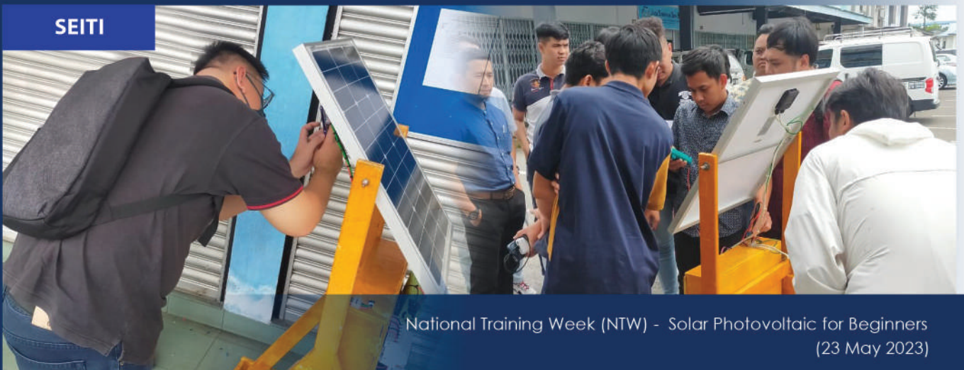
National Training Week (NTW) - Solar Photovoltaic for Beginners (23 May 2023)