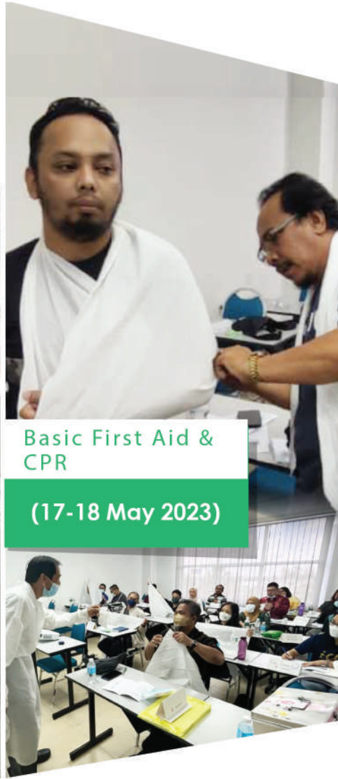
Basic First Aid & CPR