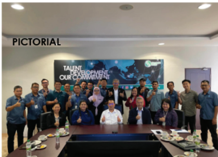
A Warm Welcome to the Delegation from Jabatan Pembangunan Sumber Manusia Sabah (JPSM) and Unit Perancang Ekonomi Negeri Sabah (UPEN). (4 October 2023)