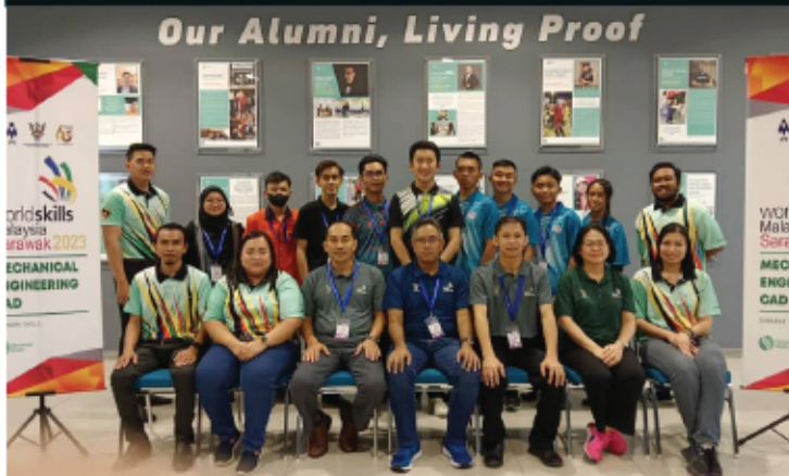
Worldskills Sarawak (WMS) 2023 Pre-qualification Competition. (28 – 30 October 2023)