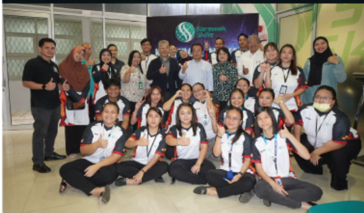
Launching Ceremony of Sarawak Skills Innovation Carnival. (21 November 2023)