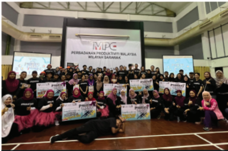
Productivity Hunt in Conjunction with Productivity & Innovation Day 2023, Organized by Malaysia Productivity Corporation. (7 October 2023)