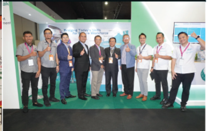
Sarawak Skills Booth at the National Human Capital Conference & Exhibition 2023 (NHCCE 2023) Held at the Malaysia International Trade and Exhibition Centre (MITEC) Kuala Lumpur. (30 October 2023)