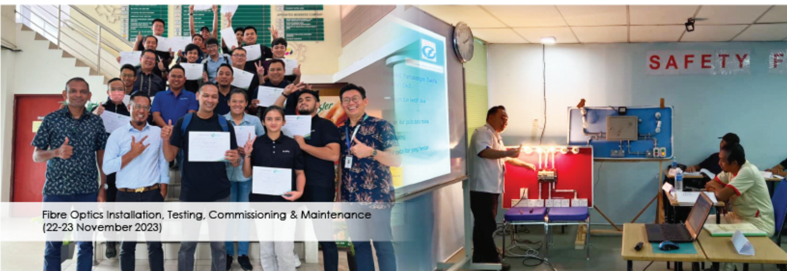
Fibre Optics Installation, Testing, Commissioning & Maintenance (22-23 November 2023)