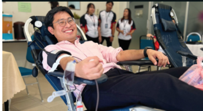
Blood Donation Campaign Co-organized by Information System Administration Students and Sarawak General Hospital Blood Bank. (14 November 2023)