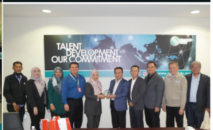
Visit by Officials from Perodua, Selangor Darul Ehsan. (5 December 2023)