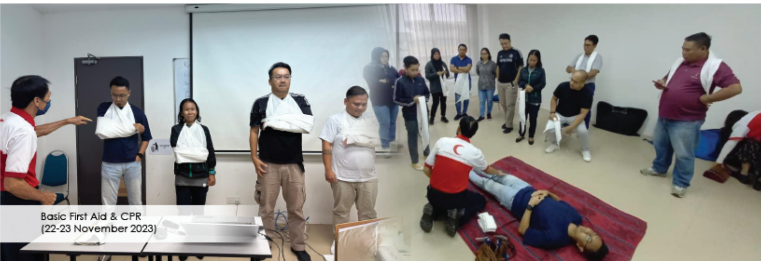
Basic First Aid & CPR (22-23 November 2023)