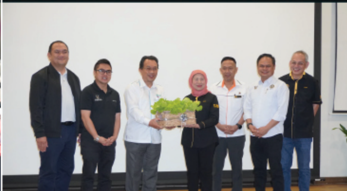
Closing Ceremony & Certificate Presentation for Community Development Programme: Smart Nutrient Film Techniques (NFT) Hydroponic, Batch 3 at Lundu Graced by The Honourable Dato' Sri Hajah Nancy binti Shukri, Minister for Women, Family & Community Development. (11 November 2023)