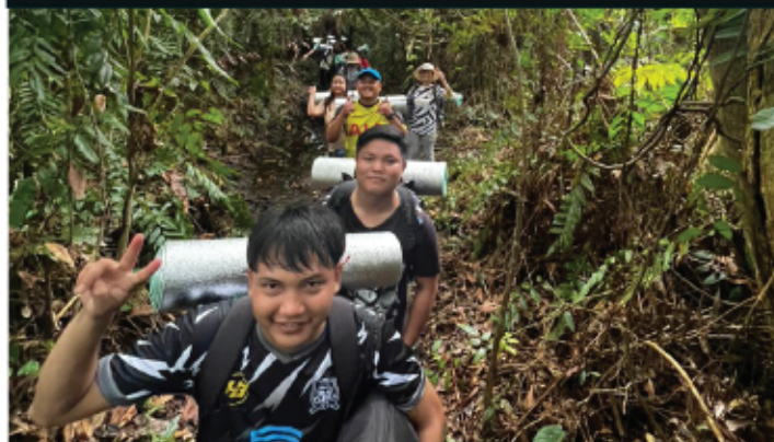
Teambuilding Human Knot Camp Co-organized by Information System Administration Final Year Students, AWISAR & Student Development Unit at Kem Wawasan Negara Sampadi. (20 - 22 October 2023)