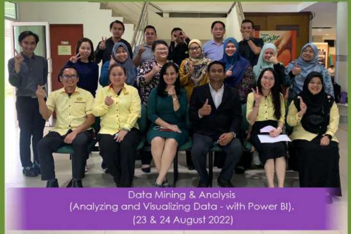
Data Mining & Analysis (Analyzing and Visualizing Data - with Power BI). (23 & 24 August 2022)