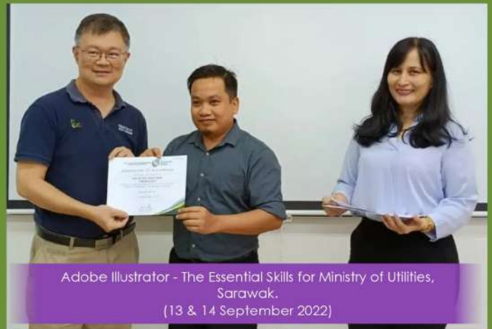
Adobe Illustrator - The Essential Skills for Ministry of Utilities, Sarawak. (13 & 14 September 2022)