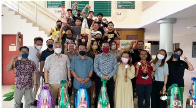
Volleyball Competition 2022. (11 August 2022)