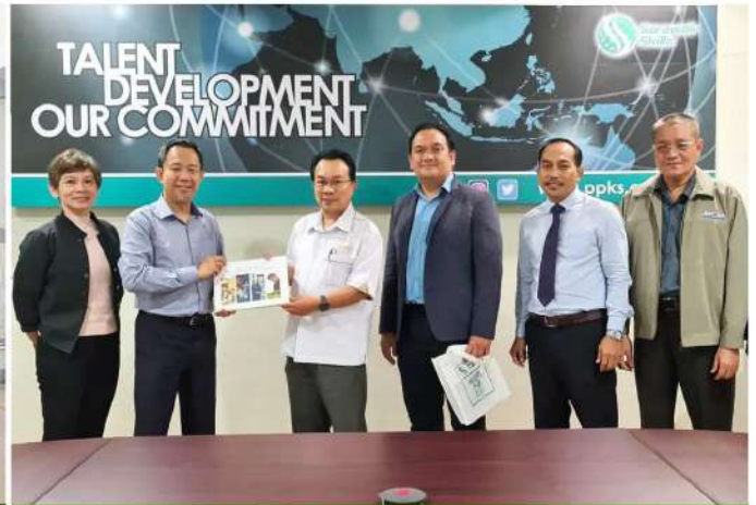
Visit by Officials from Institut Teknologi Petroleum PETRONAS (INSTEP) to Sarawak Skills. (3 August 2022)