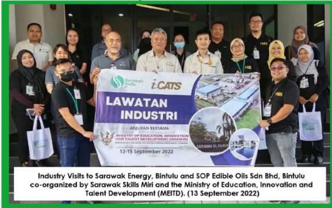
Industry Visits to Sarawak Energy, Bintulu and SOP Edible Oils Sdn Bhd, Bintulu co-organized by Sarawak Skills Miri and the Ministry of Education, Innovation and Talent Development (MEITD). (13 September 2022)