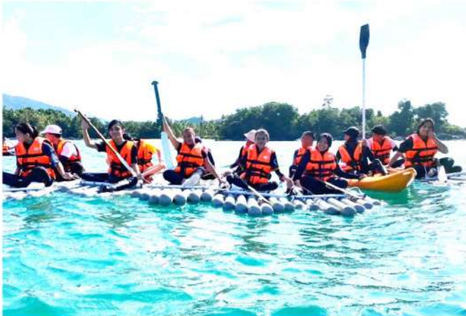
Team Building Organized by Student Development Unit, Sarawak Skills and AWISAR at Alapong Camp, Pandan Beach, Lundu. (1 - 3 July 2022)