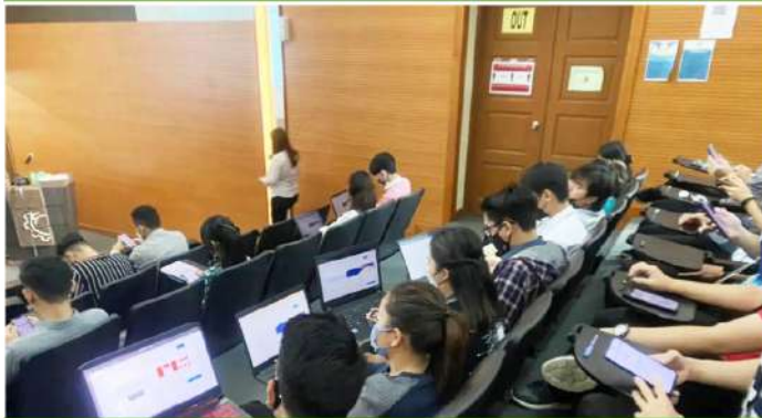
Career Counselling Workshop and MyFuture Jobs Profiling Session for Sarawak Skills Students Organized by PERKESO and Student Development Unit. (30 August 2022)