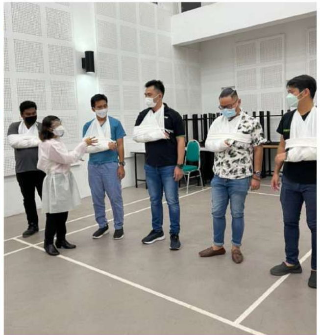
Basic First Aid & CPR. (26 - 27 July 2022)