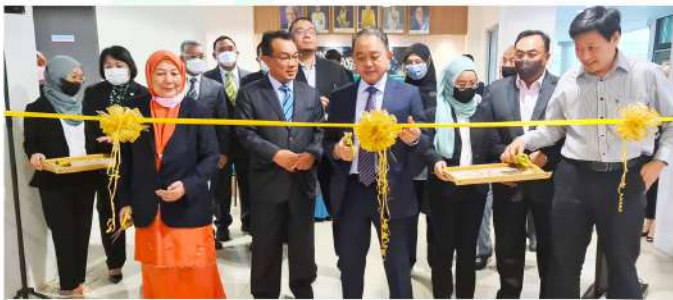
Ribbon-Cutting at the entrance to the Sarawak Skills' Talent Development Gallery.