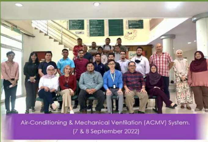
Air-Conditioning & Mechanical Ventilation (ACMV) System. (7 & 8 September 2022)