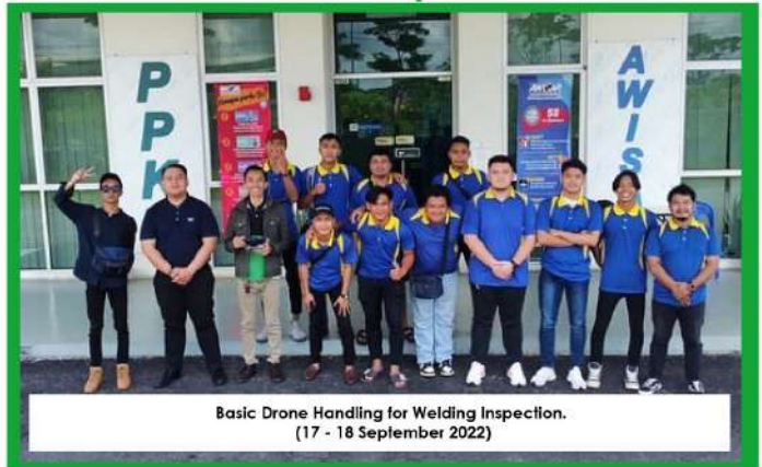
Basic Drone Handling for Welding Inspection. (17 - 18 September 2022)