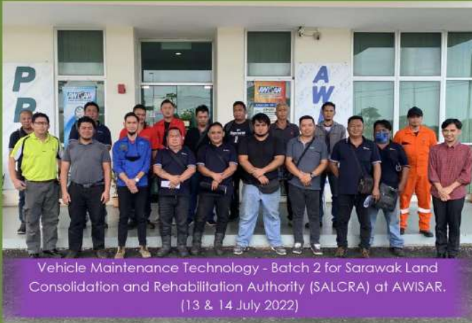
Vehicle Maintenance Technology - Batch 2 for Sarawak Land Consolidation and Rehabilitation Authority (SALCRA) at AWISAR. (13 & 14 July 2022)