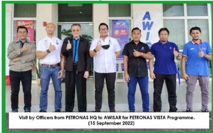
Visit by Officers from PETRONAS HQ to AWISAR for PETRONAS VISTA Programme. (15 September 2022)