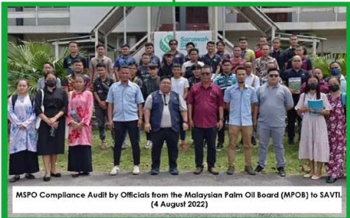
MSPO Compliance Audit by Officials from the Malaysian Palm Oil Board (MPOB) to SAVTI. (4 August 2022)