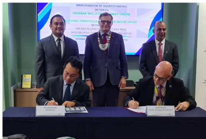
Signing of MoU Between Sarawak Skills Development Centre and National Open College Network (NOCN) Group.