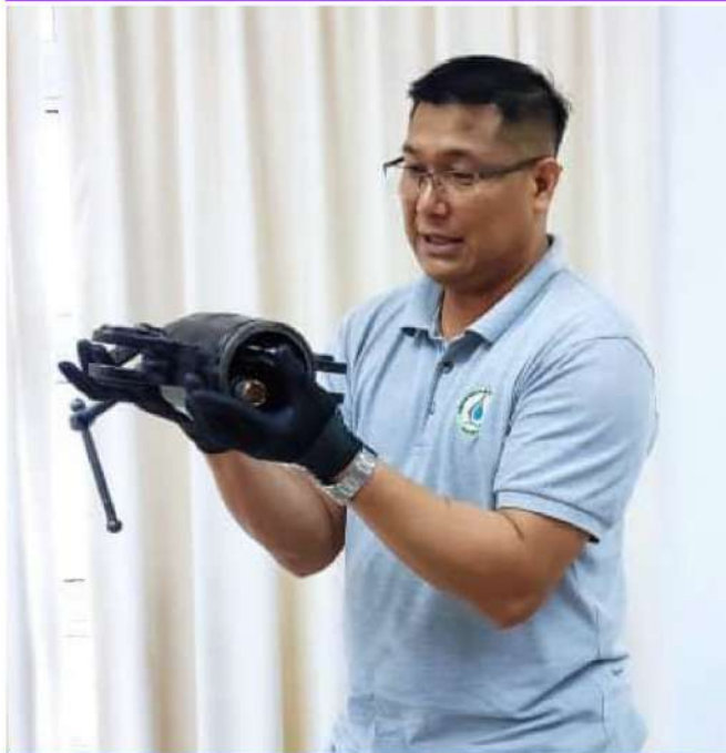
Pipefitter (Practical Class). (20 - 23 August 2022)