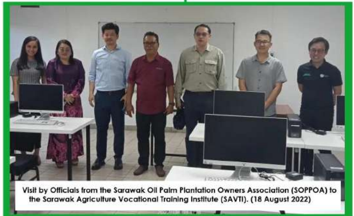
Visit by Officials from the Sarawak Oil Palm Plantation Owners Association (SOPPOA) to the Sarawak Agriculture Vocational Training Institute (SAVTI). (18 August 2022)