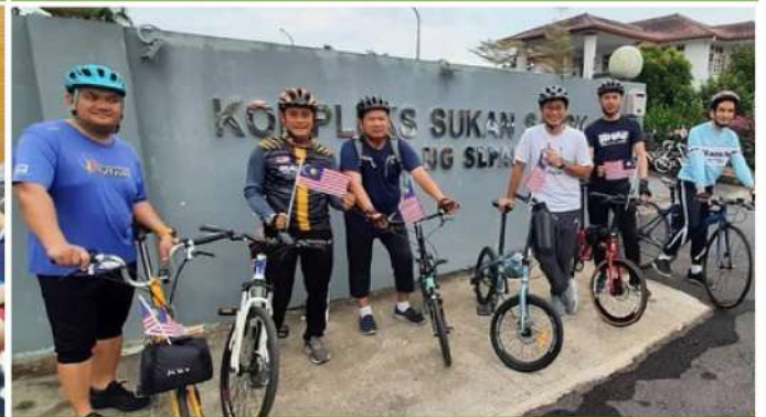
Fun Ride Merdeka Day Organized by Sarawak Skills Bicycle Club (SSBC). (31 August 2022)