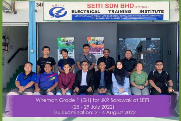
Wireman Grade 1 (G1) for JKR Sarawak at SEITI. (25 - 29 July 2022) EIU Examination: 2 - 4 August 2022