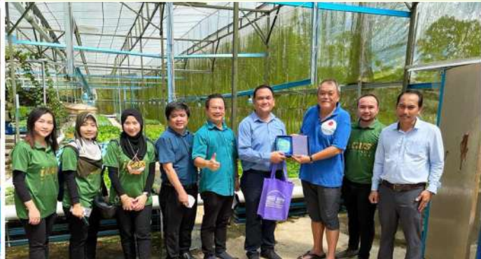
Study Visit to an Aquaponic Vegetable Farm at Rantau Panjang, Batu Kawa, Kuching. (29 August 2022)