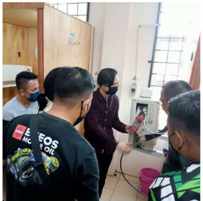
Split Unit Air-Conditioner Installation, Commissioning, Troubleshooting, Servicing & Maintenance. (6 - 8 September 2022)