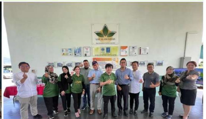
Study Visit to Sar-Alam Indah Sdn Bhd's Sludge Treatment Plant at Matang-Moyan Organized by i-CATS University College. (22 September 2022)