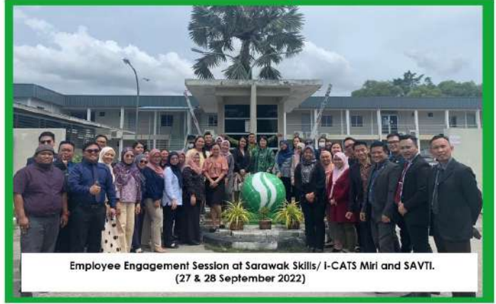
Employee Engagement Session at Sarawak Skills/ i-CATS Miri and SAVTI. (27 & 28 September 2022)