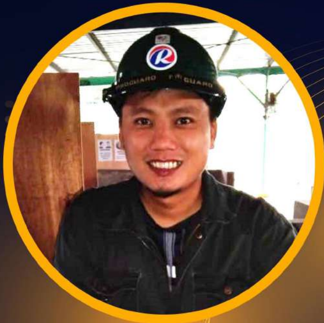
BROERSLERS ANAK RINAH

“ YOU HAVE THE ABILITY AND TENACITY TO LEARN NEW SKILLS AND SUCCEED! IT TAKES PATIENCE AND PERSEVERANCE! ”