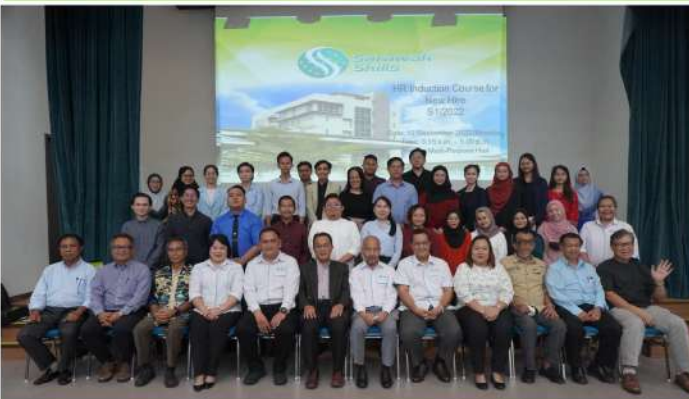
Staff Induction S1/2022. (12 September 2022)