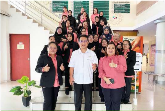
Workshop to Strengthen the Implementation of Skills Training Based on Code of Practice for TVET Programme Accreditation (COPTPA) with Jabatan Wanita dan Keluarga Sarawak (JWKS). (13 - 17 July 2022)