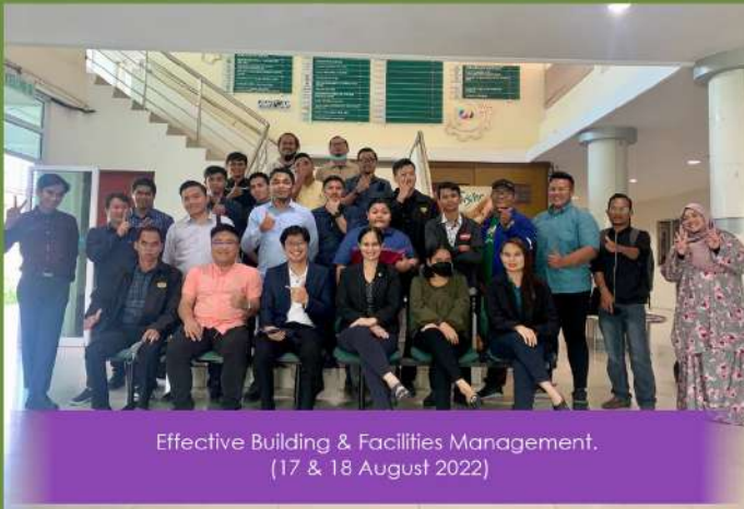
Effective Building & Facilities Management. (17 & 18 August 2022)