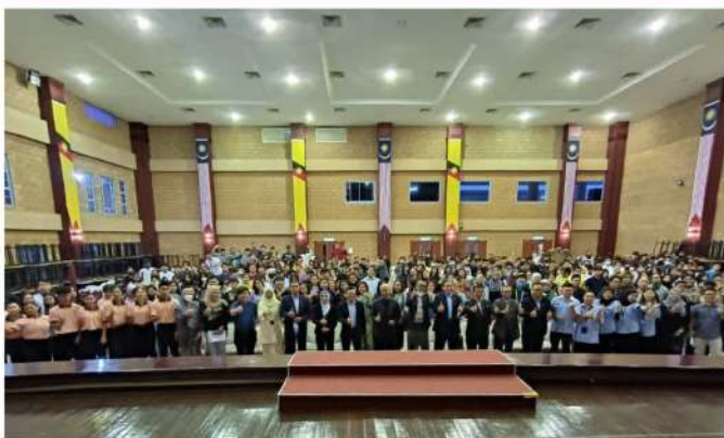
Pledge of Allegiance Ceremony for New Students of i-CATS University College. (2 September 2022).