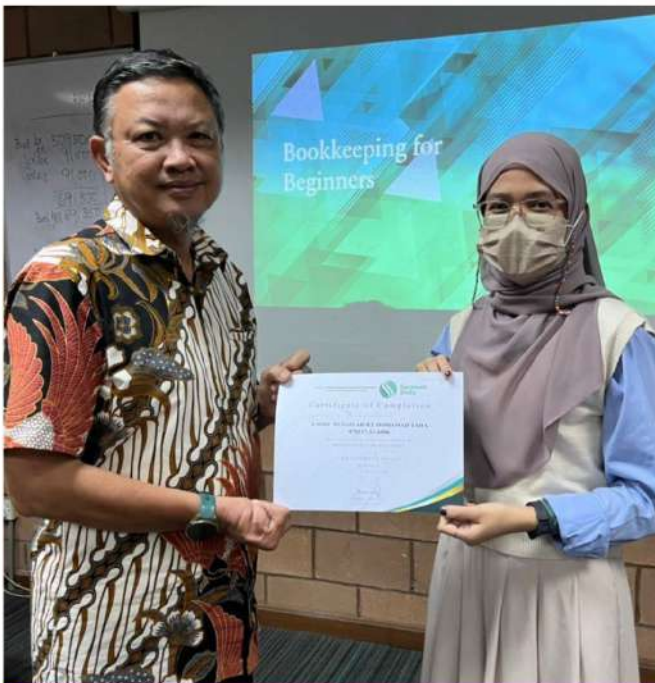
Bookkeeping for Beginners. (20 - 21 July 2022)