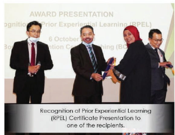
Recognition of Prior Experiential Learning (RPEL) Certificate Presentation to one of the recipients.

Seven (7) staff members from Senari Synergy Sdn. Bhd. completed either the Malaysian Skills Certificate (Level 2) in Office Administration or the Malaysian Skills Certificate (Level 3) in Office Administration Supervision. For Biomedix Solutions Sdn. Bhd., ten (10) staff members completed the Malaysian Skills Diploma (Level 4) in Electronic Product Development. At Sarawak Skills, the Recognition of Prior Experiential Learning (RPEL) programme enables members of the workforce to earn industry-relevant certifications based on skills, knowledge and experience gained during the course of their work or careers.