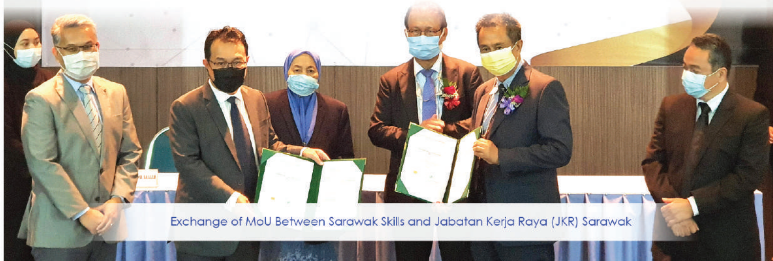
Exchange of MoU Between Sarawak Skills and Jabatan Kerja Raya (JKR) Sarawak

T he Sarawak Public Works Department (JKR Sarawak) and the Sarawak Skills Development Centre have entered into a Memorandum of Understanding (MoU) on the provision of training and development initiatives for the department's workforce in the state.