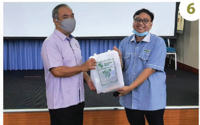
Benchmarking Visit by Students Development Unit, Sarawak Skills Kuching to Politeknik Kuching Sarawak (22 October 2020)