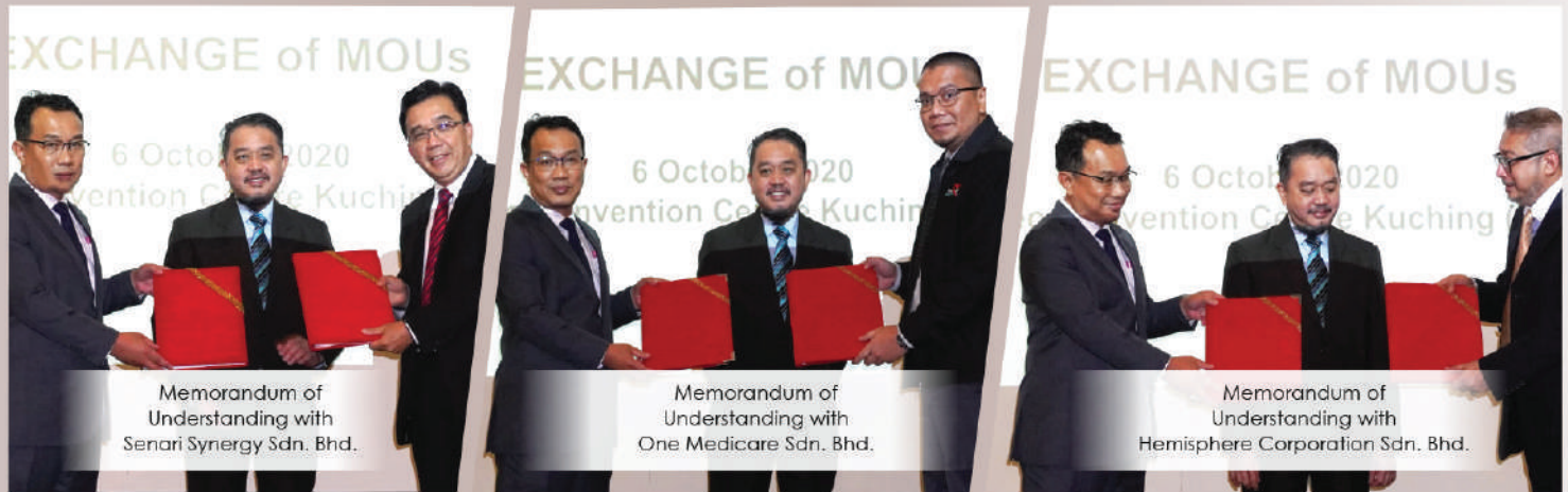
Memorandum of Understanding with Senari Synergy Sdn. Bhd.