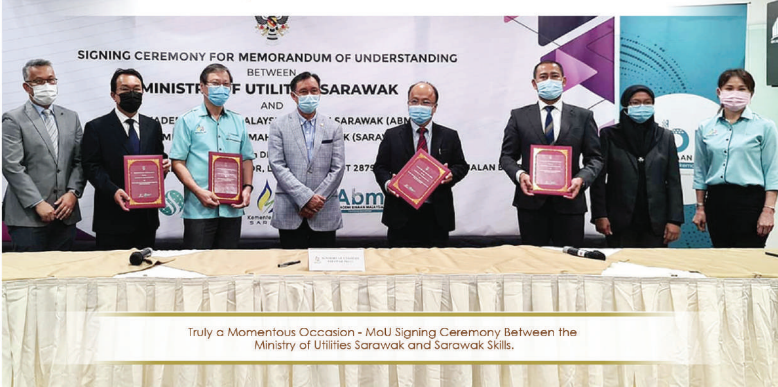
Truly a Momentous Occasion - MoU Signing Ceremony Between the Ministry of Utilities Sarawak and Sarawak Skills.

The signing of a Memorandum of Understanding (MoU) between the Ministry of Utilities Sarawak and the Sarawak Skills Development Centre has paved the way for Sarawak Skills to produce qualified pipe fitters and mains layers.