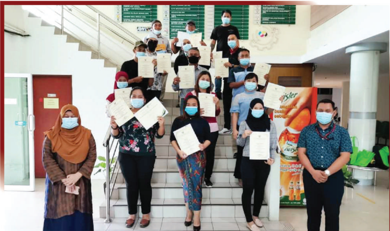
AutoCad 2D for Unit Pembangunan Kontraktor dan Pembekal (UPKP) (4 - 6 November 2020)