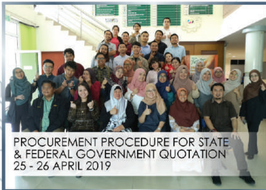
PROCUREMENT PROCEDURE FOR STATE & FEDERAL GOVERNMENT QUOTATION 25 - 26 APRIL 2019