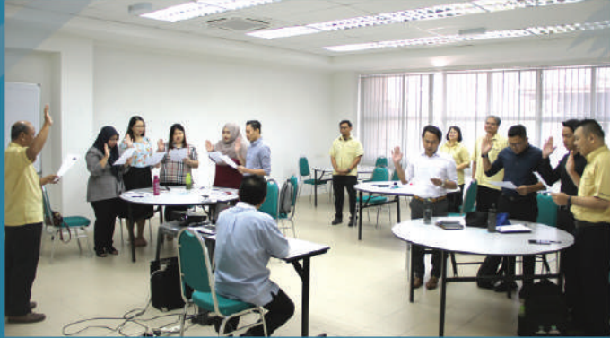
Induction Course for New Staff 10 April 2019