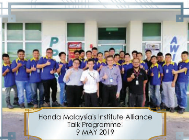
Honda Malaysia's Institute Alliance Talk Programme 9 MAY 2019