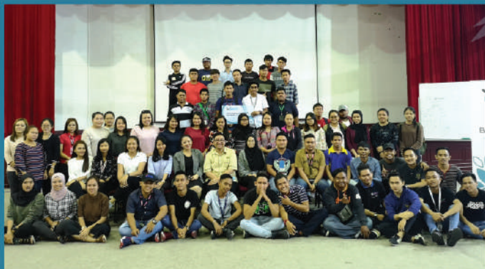
Be Smart Financial Literacy Programme CIMB Foundation 26 June 2019