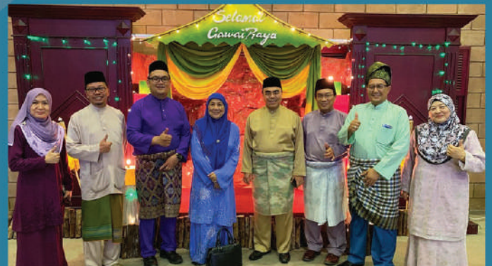
PPKS Mesra Gawai Raya Ceremony 28 June 2019