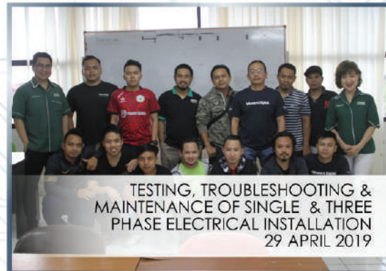
TESTING, TROUBLESHOOTING & MAINTENANCE OF SINGLE & THREE PHASE ELECTRICAL INSTALLATION 29 APRIL 2019