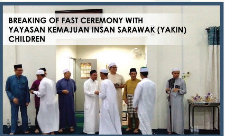
BREAKING OF FAST CEREMONY WITH YAYASAN KEMAJUAN INSAN SARAWAK (YAKIN) CHILDREN