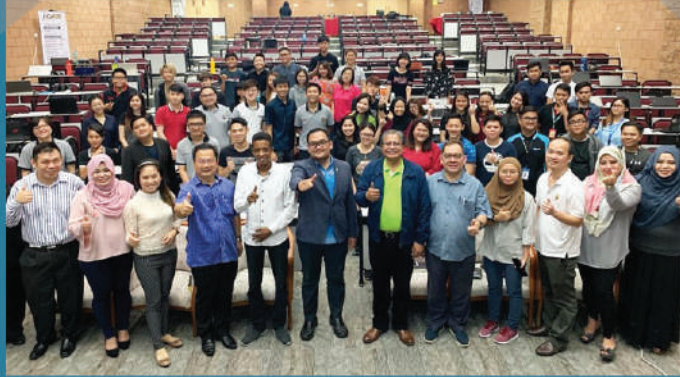
Shopify Dropshipping Workshop 2019 3 May 2019