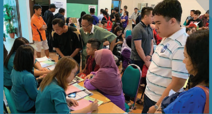
Students Registration (PPKS May Intake 2019) 6 May 2019