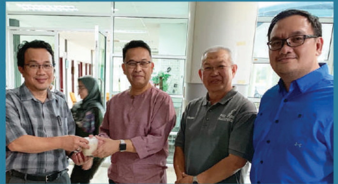
Bubur Lambuk Distribution in Conjunction with the Month of Ramadhan 17 May 2019