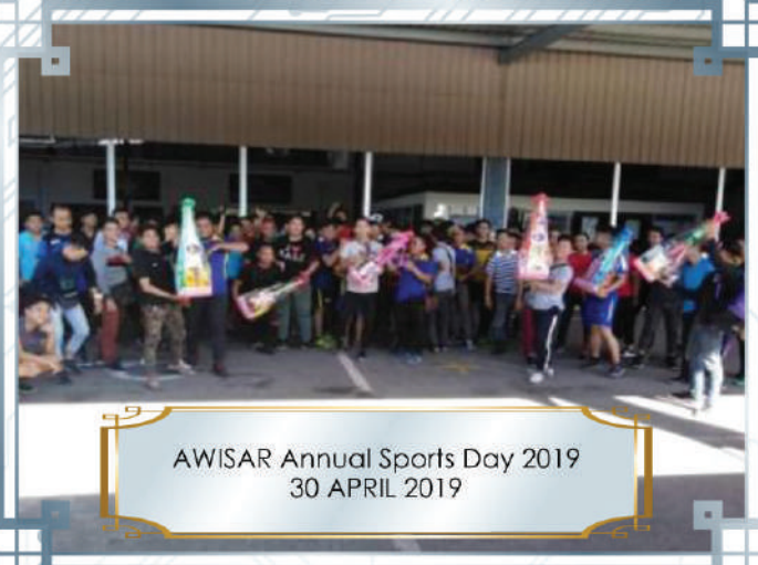
AWISAR Annual Sports Day 2019 30 APRIL 2019