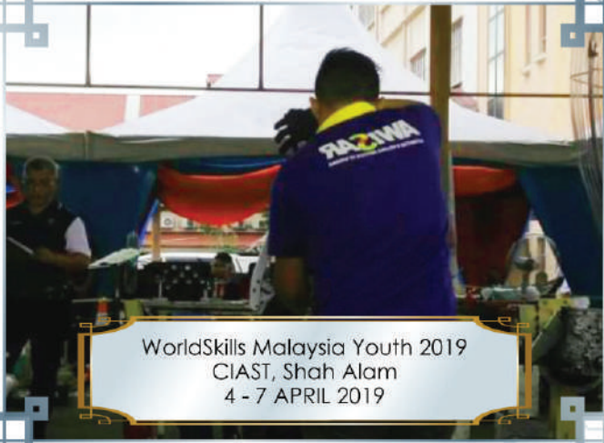
WorldSkills Malaysia Youth 2019 CIASST, Shah Alam 4 - 7 APRIL 2019