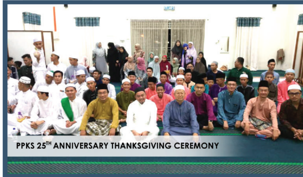
PPKS 25 TH ANNIVERSARY THANKSGIVING CEREMONY