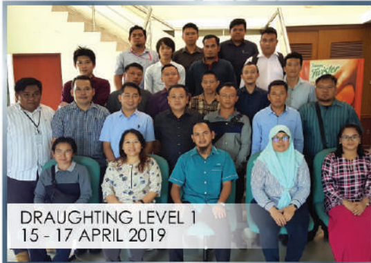
DRAUGHTING LEVEL 1 15 - 17 APRIL 2019