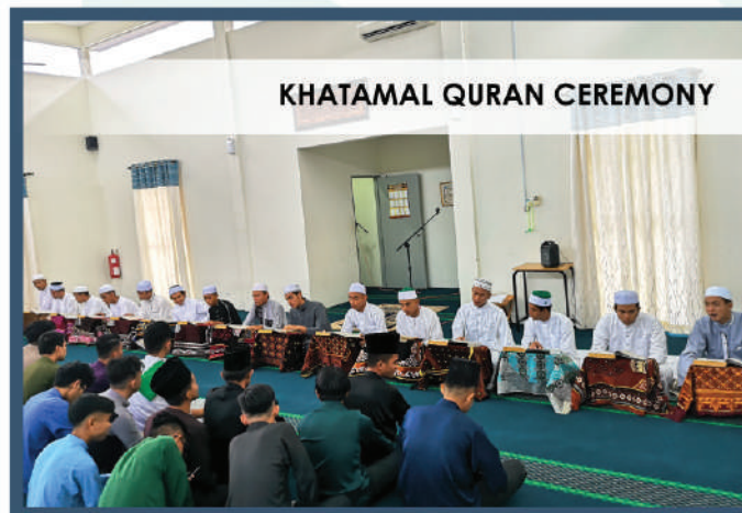
KHATAMAL QURAN CEREMONY