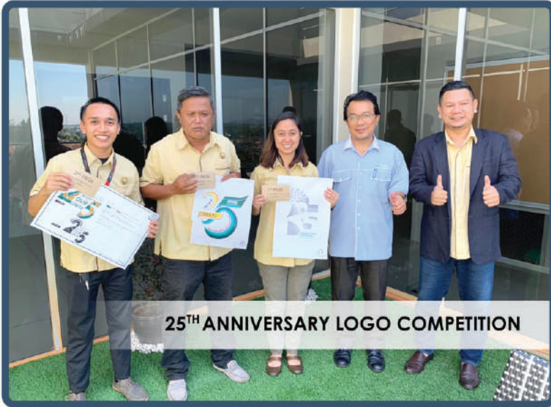
25 TH ANNIVERSARY LOGO COMPETITION