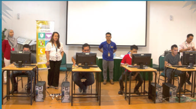
Election of Students' Representatives 18 May 2019