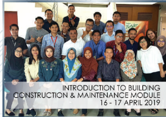
INTRODUCTION TO BUILDING CONSTRUCTION & MAINTENANCE MODULE 16 - 17 APRIL 2019