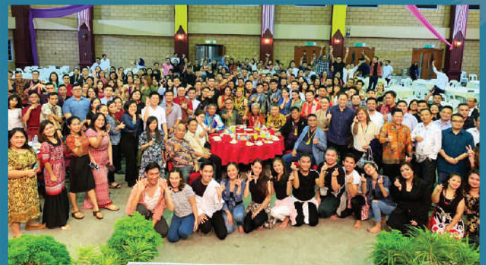
Dinner with Sarawak Dayak IPTA/IPTS Students 2019 23 June 2019