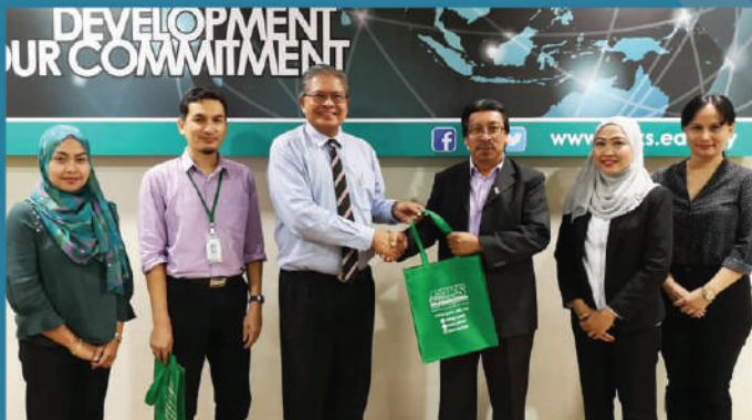
Visit by Officials from Penang Water Services Academy 17 June 2019