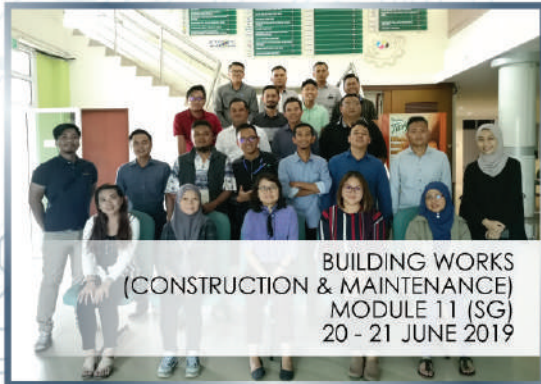
BUILDING WORKS (CONSTRUCTION & MAINTENANCE) MODULE 11 (SG) 20 - 21 JUNE 2019