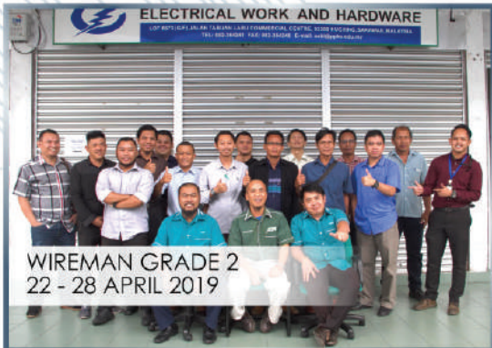
WIREMAN GRADE 2 22 - 28 APRIL 2019