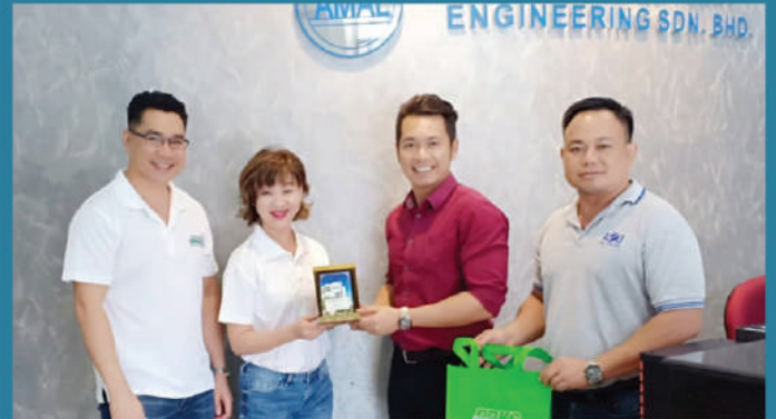
Visit to Executive Director of Amalgamated Plant Engineering Sdn Bhd 27 May 2019