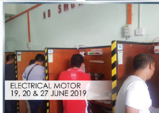
ELECTRICAL MOTOR 19, 20 & 27 JUNE 2019