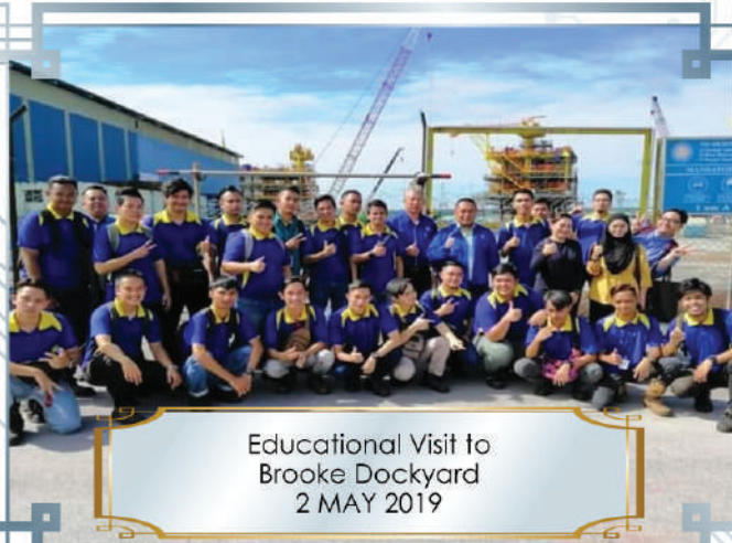
Educational Visit to Brooke Dockyard 2 MAY 2019