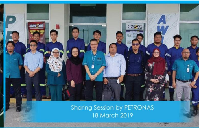
Sharing Session by PETRONAS 18 March 2019