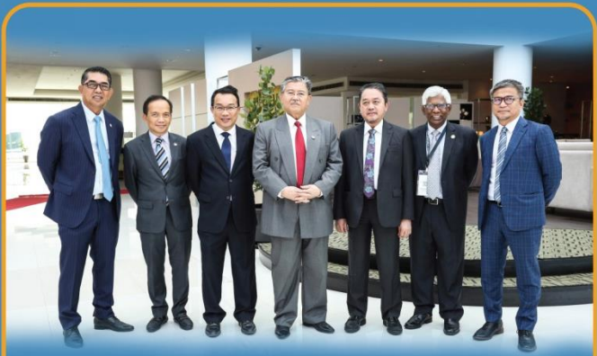
TVET Symposium 2019 Our Thanks for Your Support!

Indeed, the TVET Symposium 2019 has paved the way for all stakeholders to participate in the transformation of TVET and facilitate the development of future-ready talent for the Digital Economy.