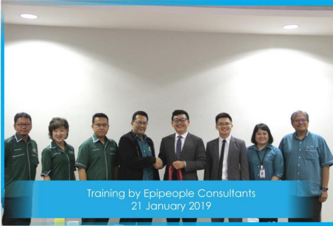
Training by Epiepeople Consultants 21 January 2019