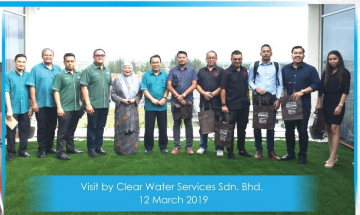
Visit by Clear Water Services Sdn. Bhd. 12 March 2019