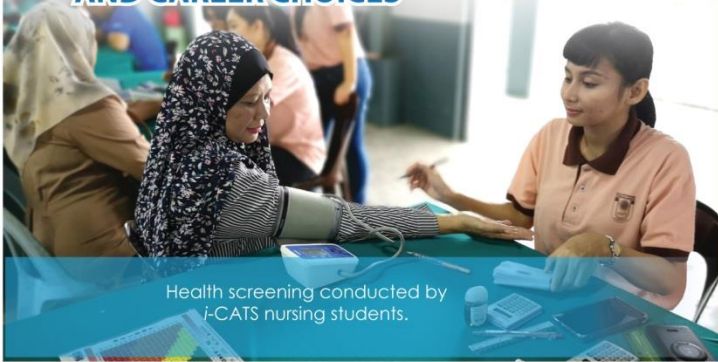
Health screening conducted by i-CATS nursing students.

For the secondary school students, school leavers and their parents, the Smart Community Programme at Kampung Semeba, Batu Kitang on 30 March 2019 was an eye-opener; it was an all-important first step along life's voyage - seeking industry-relevant qualifications leading to exciting careers.