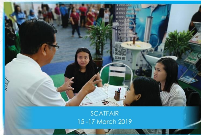
SCATFAIR 15 -17 March 2019