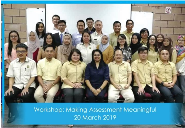
Workshop: Making Assessment Meaningful 20 March 2019