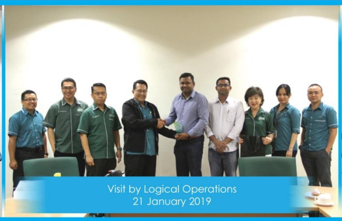
Visit by Logical Operations 21 January 2019