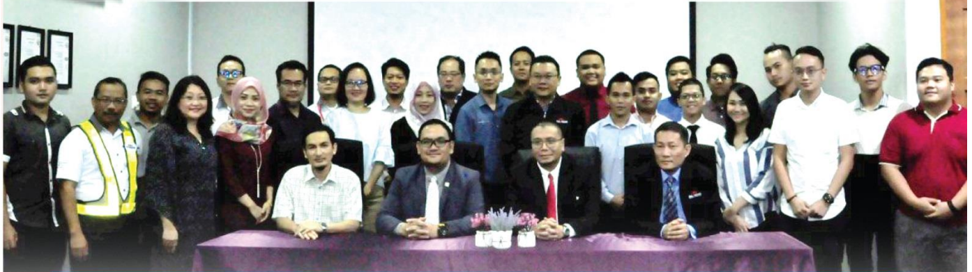
Group Photo: Partnership Beyond the Classroom