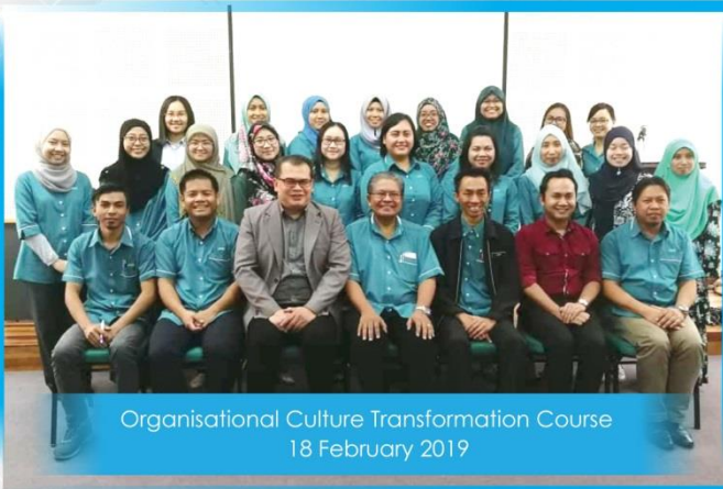
Organisational Culture Transformation Course 18 February 2019