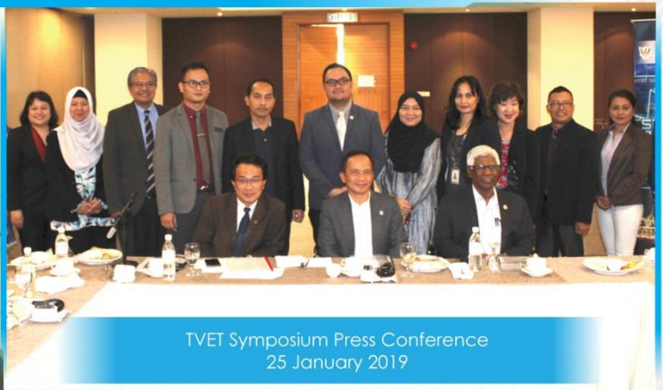
TVET Symposium Press Conference 25 January 2019