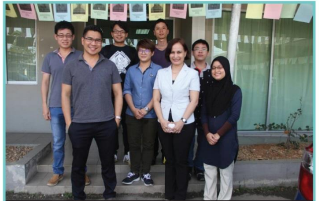
PROGRAMME TITLE : AutoCAD Application Level 1 (Public Programme) TRAINING DATE(S) : 23 - 24 November 2017 CLIENT : Sarawak and Sabah Shipowners Association VENUE : Computer Lab 2, KV Block PPKS