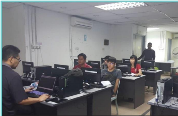
PROGRAMME TITLE : AutoCAD Application Level 1 (Public Programme) TRAINING DATE(S) : 31 October – 2 November 2017 CLIENTS : Yong Soon Piping Sdn Bhd, Timor Kencana Sdn Bhd, Perunding Najna VENUE : Sarawak Electrical Industry Training Institute (SEITI)