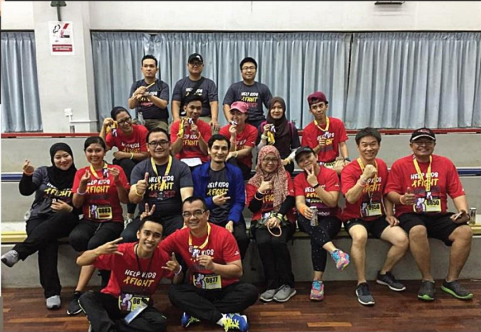
SECA Night Run [ 28 October 2017 ]