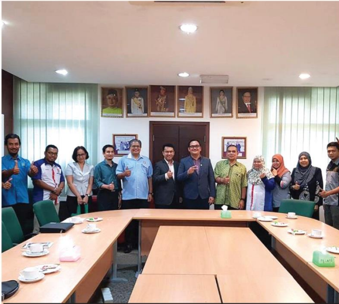
Visitors from Wood Industry Skills Development Centre (WISDEC) [ 21 December 2017 ]