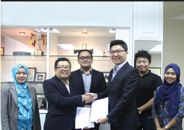
Signing Ceremony between i-CATS and Kodorra [ 17 October 2017 ]