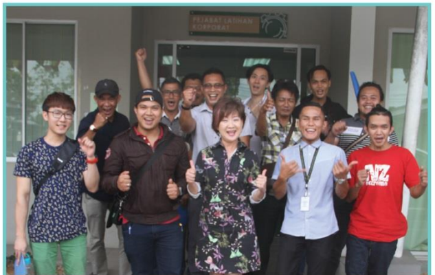
PROGRAMME TITLE : Basic Electrical/Electronic Measurement & Troubleshooting Techniques Level 1 TRAINING DATE(S) : 16 & 17 October 2017 CLIENT : Taiyo Yuden (Sarawak) VENUE : PPKS