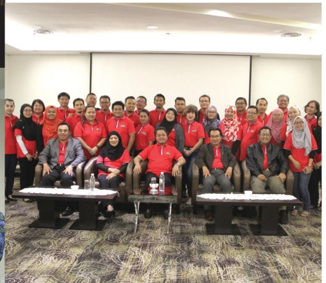
Strategic Planning Workshop [ 14 & 15 December 2017 ]