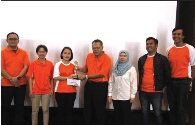
"Creating New Out of Old Competition" Bersempena dengan Hari Alam Sekitar Negara (HASN) [ 10 October 2017 ]