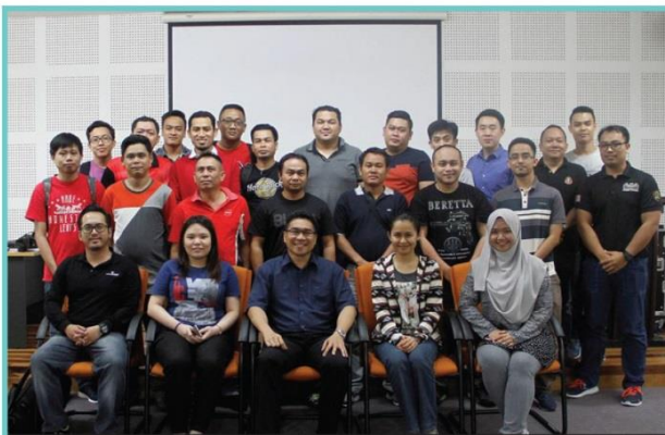
PROGRAMME TITLE : Programmable Logic Control (PLC) Advanced Level TRAINING DATE(S) : 23 & 24 October 2017 CLIENT : Taiyo Yuden (Sarawak) VENUE : PPKS