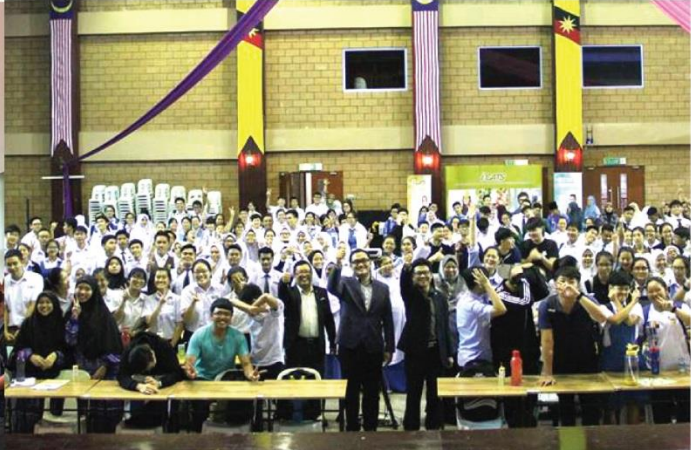
i-CATS SPM 2017 Excellence Programme [ 12 October 2017 ]