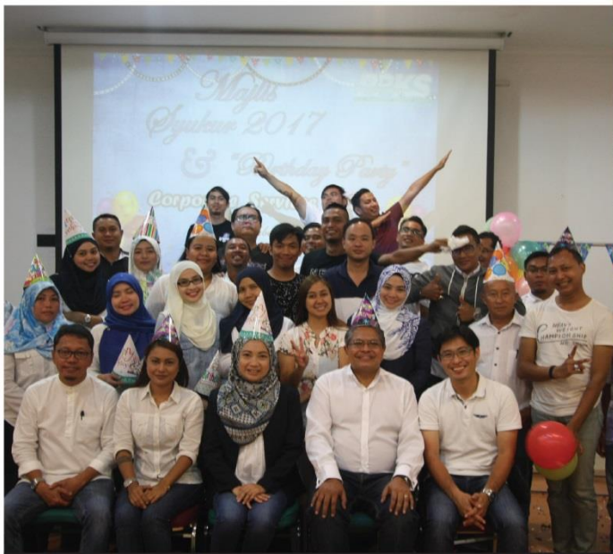
Corporate Services Division Get-together [ 22 December 2017 ]