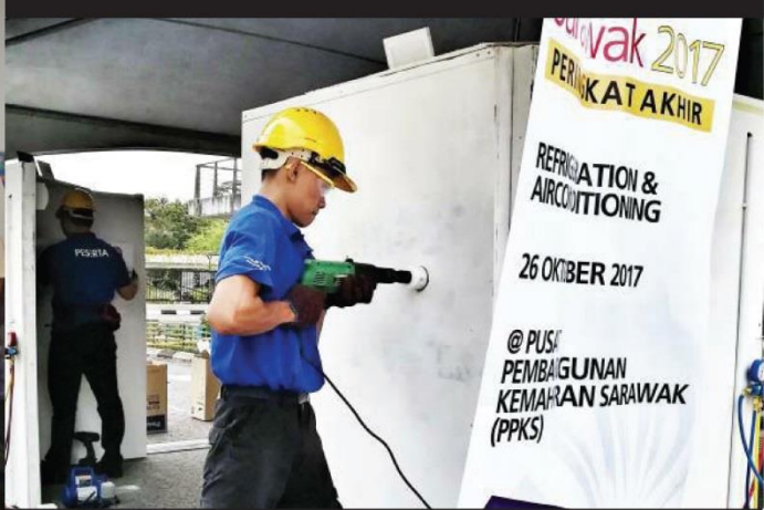
WorldSkills Malaysia Sarawak 2017 Competition: Refrigeration and Air-conditioning [ 26 October 2017 ]