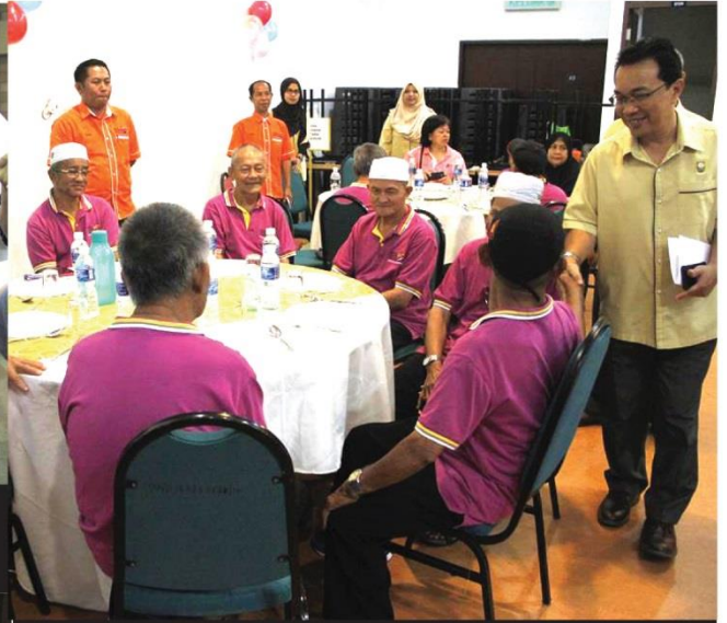
Corporate Social Responsibility (CSR): For Residents of Rumah Seri Kenangan Kuching [ 18 October 2017 ]