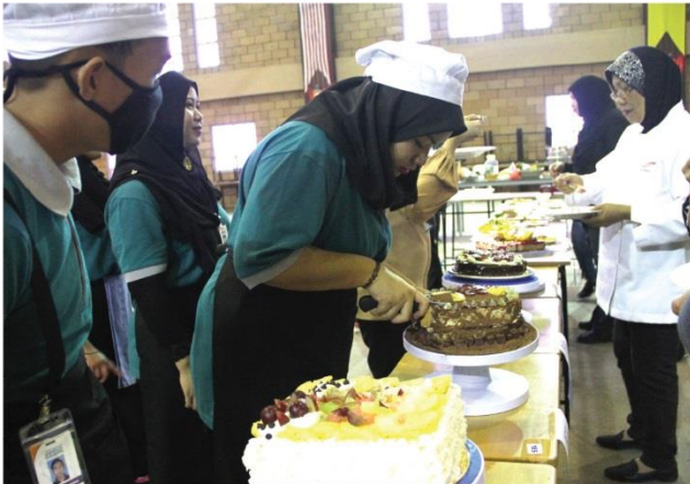
Pertandingan Kulinari dan Pastri pelajar Jabatan Kebajikan Masyarakat [ 6 October 2017 ]