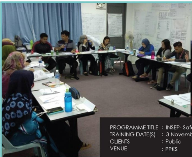
PROGRAMME TITLE : INSEP- Safety & Health Officer (Batch 3 / 2017) TRAINING DATE(S) : 3 November – 11 May 2018 CLIENTS : Public VENUE : PPKS