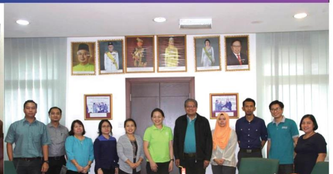
Lawatan Kerja Jabatan Alam Sekitar Negeri Sarawak Ke PPKS Program Pertandingan Reka Cipta Bahan Baru Daripada Bahan Buangan (Creating New Out of Old) sempena Hari Alam Sekitar Negara (HASN) Peringkat Negeri Sarawak 2017 (25 August 2017)