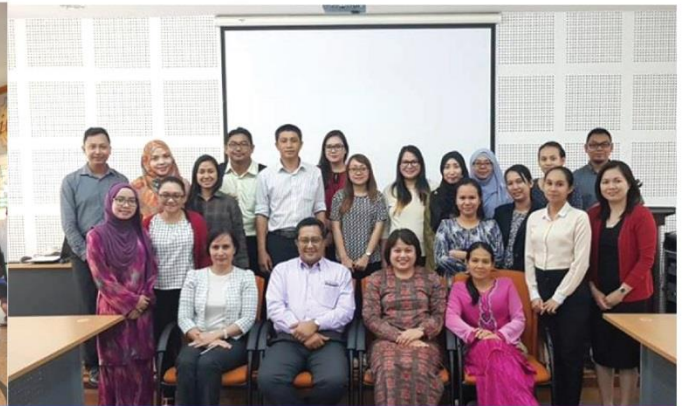
ISO 9001:2015 Document Review and Risk Identification Workshop (11 July 2017)