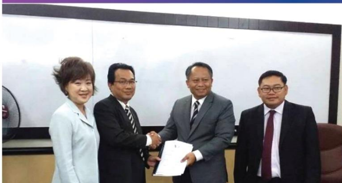
MoU Signing with State Planning Unit (SPU) at Wisma Bapa Malaysia, Kuching (23 August 2017)