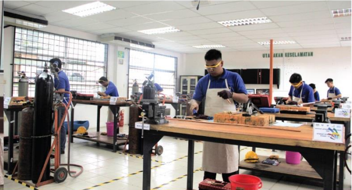
Pertandingan Worldskills Malaysia Sarawak 2017 bagi Kategori HVAC (Refrigeration & Air-Conditioning) Peringkat Pra-kelayakan (29 August 2017)