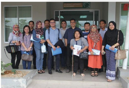
Training Title : AutoCAD Application Level 2 Client : Jabatan Kerja Raya (JKR) Date : 8 - 10 August 2017 Venue : Computer Lab, PPKS Kuching