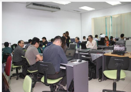
Training Title : Industry 4.0 Big Data Analytics Training Course Date : 14 - 16 August 2017 Venue : Computer Lab, PPKS Kuching