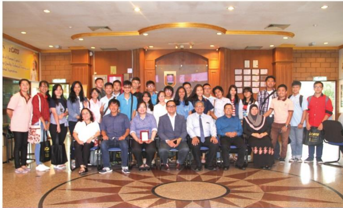
SMA Santo Paulus, Pontianak, Indonesia: 5-day Study & Tour Programme at i-CATS (3 - 7 July 2017)