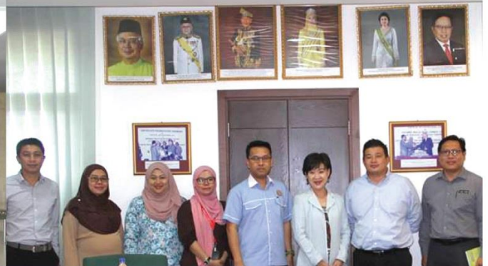
Lawatan Pemantauan Program Peningkatan Kapasiti dan Kapabiliti Kumpulan Khusus (PPKKKK) Sarawak Bil. 1/2017 (25 July 2017)