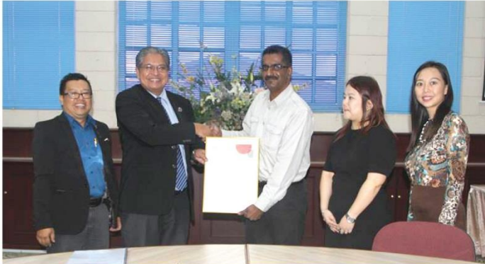
Signing Ceremony between IDP Education Limited and PPKS Ilmu Sdn. Bhd. ( i -CATS): Appointment of i -CATS as an Authorised Test Registration Centre for the IELTS Exams (28 August 2017)