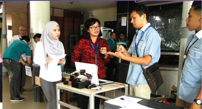
Pameran dan Penilaian Projek Tahun Akhir Pelajar Mekatronik Tahap 4 (7 September 2017)