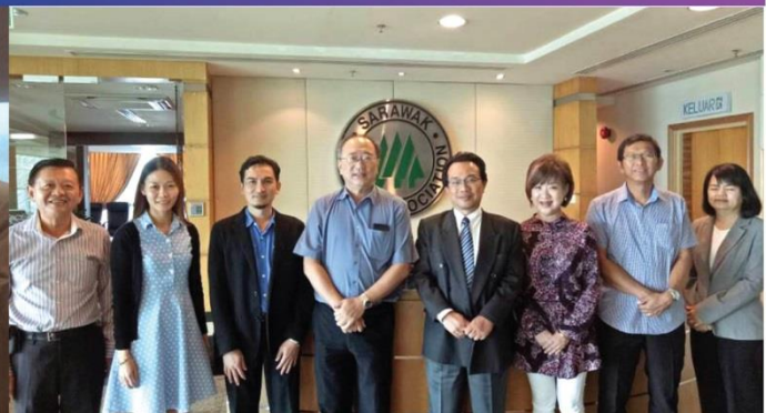
PPKS Courtesy Visit to Sarawak Timber Association (STA) (15 September 2017)