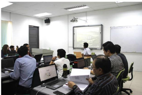
Training Title : Industry 4.0 Big Data Training Date : 29 August 2017 Venue : Computer Lab, PPKS Kuching