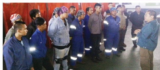
Briefing before Welder Qualification Test