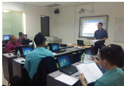
Training Title : AutoCAD Advanced Application - 3D Client : Jabatan Kerja Raya (JKR) Date : 12 - 14 September 2017 Venue : Computer Lab, PPKS Kuching