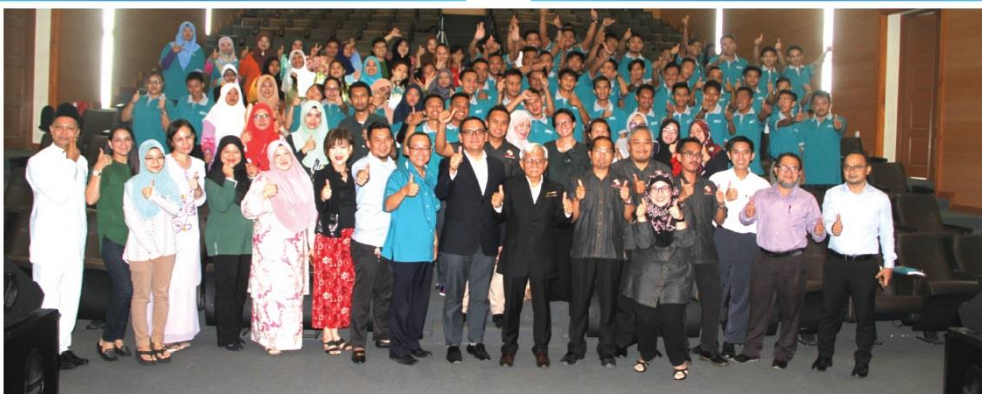
Program Title : Program Kemahiran dan Pemandaran Kerja Jabatan Kebajikan Masyarakat Sarawak (Bidang Sistem Maklumat, Automotif, Kulinari dan Pastri) Training Date : 17 July - 1 December 2017 Venue : PPKS Kuching