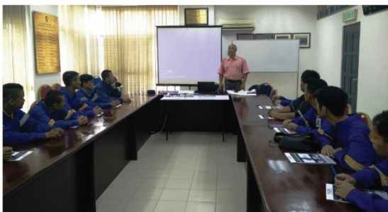
Safety Course for Apprenticeship Students

With the successful launch of the Welding Technician programme, PPKS will also be reaching out to students (Penilaian Menengah Rendah (PMR)/Pentaksiran Tingkatan 3 (PT3) or Sijil Pelajaran Malaysia (SPM) school leavers) to join the Apprentice Scheme for the Electrical Technician, IT Technician and Mechatronics programmes.