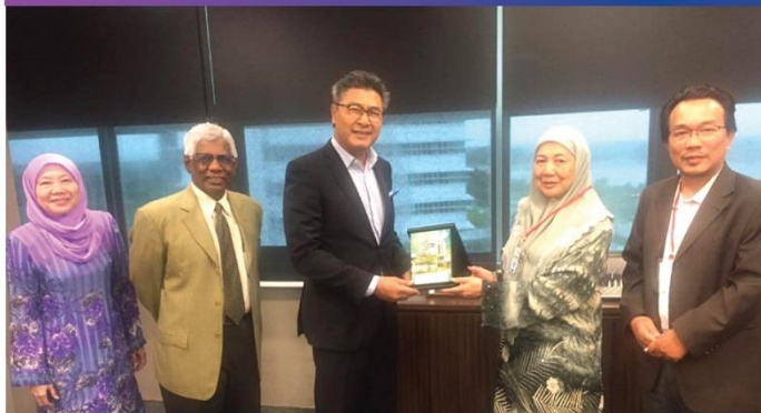
Courtesy Visit to YBhg. Datu Sudarsono Osman, Permanent Secretary, Ministry of Education, Science and Technological Research, Sarawak (8 September 2017)