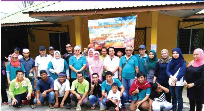
Program Ibadah Korban 1438H Anjuran Surau Darul Ilmi PPKS dengan kerjasama Surau Nur Akmal, Kpg Belimbing, Krokong, Bau (3 September 2017)