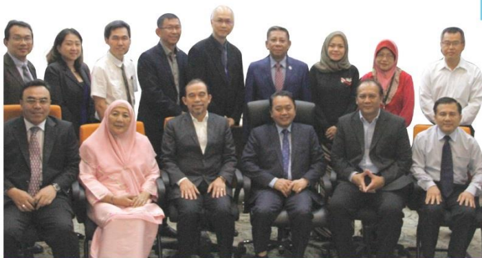
PPKS Management Council Members (2017 - 2020)

For the 2017 - 2020 term, the distinguished members of the Management Council are as follows: