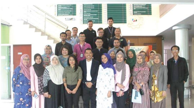
Campus Management Solution Workshop (14 July 2017)