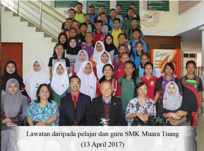
Lawatan daripada pelajar dan guru SMK Muara Tuang (13 April 2017)