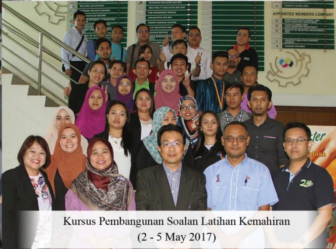
Kursus Pembangunan Soalan Latihan Kemahiran (2 - 5 May 2017)