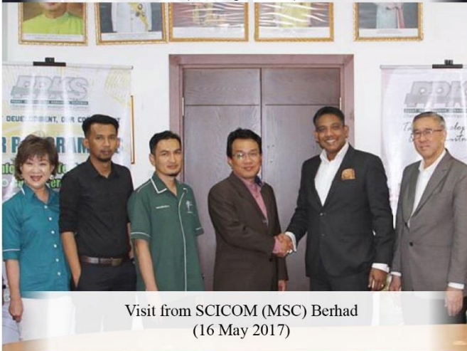
Visit from SCICOM (MSC) Berhad (16 May 2017)