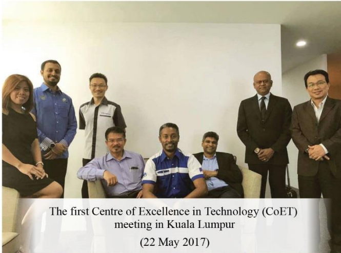
The first Centre of Excellence in Technology (CoET) meeting in Kuala Lumpur (22 May 2017)