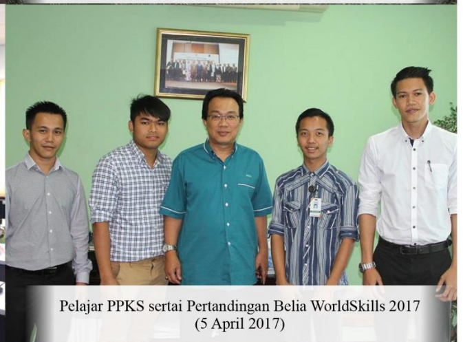
Pelajar PPKS sertai Pertandingan Belia WorldSkills 2017 (5 April 2017)