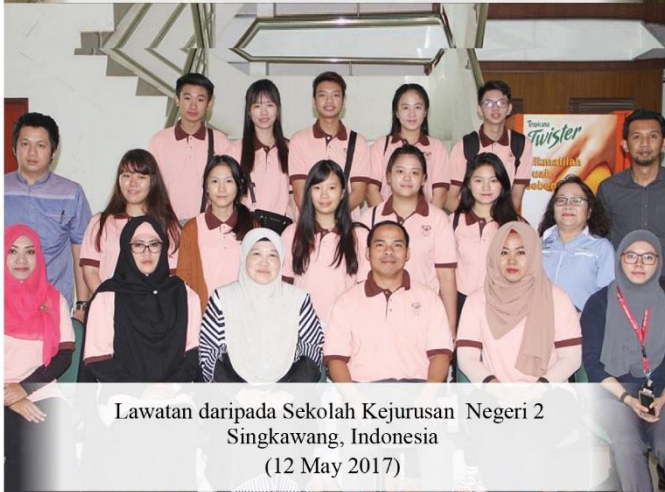
Lawatan daripada Sekolah Kejuruan Negeri 2 Singkawang, Indonesia (12 May 2017)