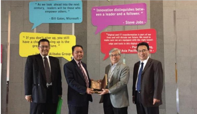
Visit to University Malaysia of Computer Science & Engineering (11 April 2017)