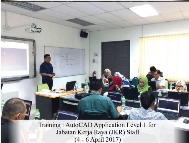
Training : AutoCAD Application Level 1 for Jabatan Kerja Raya (JKR) Staff (4 - 6 April 2017)