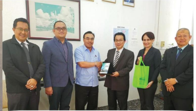
Courtesy call on Tuan Haji Hilmy Othman, Deputy Mayor of Kuching City South and Treasurer of PPKS's Management Council (4 April 2017)