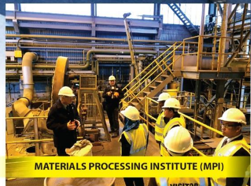
MATERIALS PROCESSING INSTITUTE (MPI)

The Study Visit to the United Kingdom by a delegation from PPKS together with representatives from the British High Commission, Kuala Lumpur and the Workforce Development Unit, Chief Minister's Office (Sarawak), has set the stage for a host of joint initiatives aimed at facilitating Sarawak's economic and digital transformation.