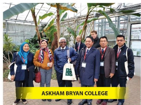
ASKHAM BRYAN COLLEGE