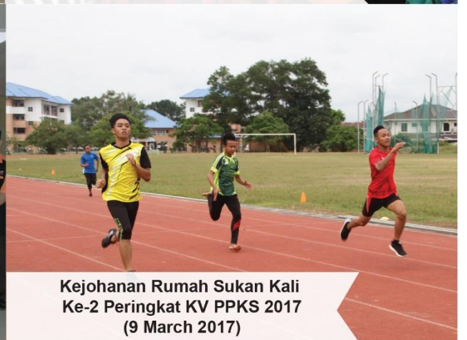
Kejohanan Rumah Sukan Kali Ke-2 Peringkat KV PPKS 2017 (9 March 2017)