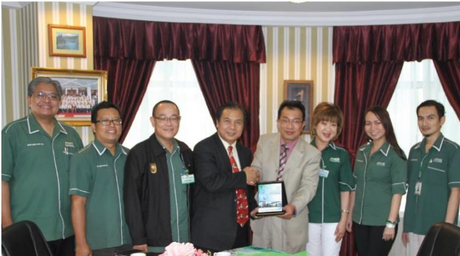
Courtesy Visit to YB Datuk Jerip Susil, Assistant Minister for Public Health (9 January 2017)