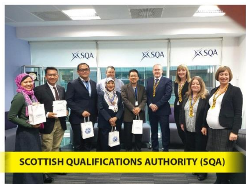
SCOTTISH QUALIFICATIONS AUTHORITY (SQA)

In line with the numerous initiatives by the Sarawak Government to accelerate the pace of development, there is an urgent need to adopt a multi-pronged approach to the development of a competent workforce to meet the needs of industry. In this respect, the Study Visit has paved the way for strategic collaborations with various U.K. educational institutions and training providers to facilitate the transfer of technology in Materials Engineering, Metallurgy, Hydroelectric Power Plant Maintenance, Hybrid and Electrical Vehicle Maintenance, and Modernization of Agriculture.