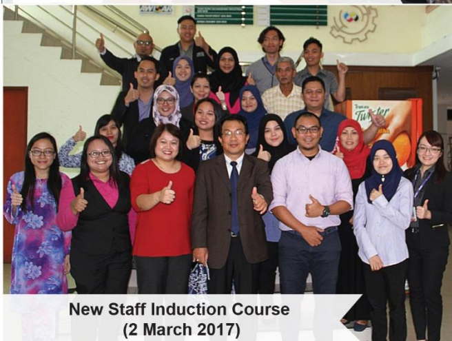
New Staff Induction Course (2 March 2017)