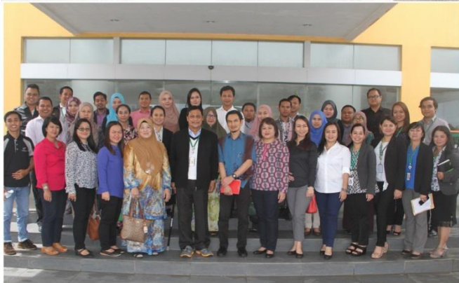
Lawatan Penanda Aras 5S ke SALCRA (17 March 2017)