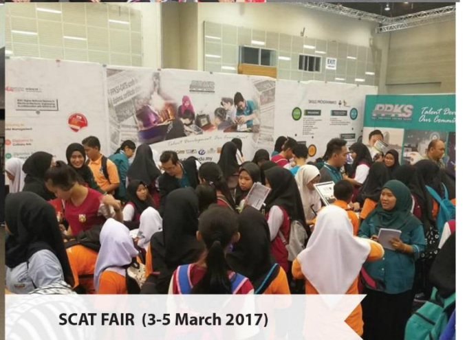
SCAT FAIR (3-5 March 2017)