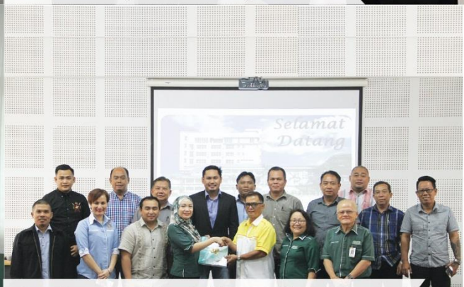
Lawatan daripada Tabung Ekonomi Gagasan Anak Bumiputera Sarawak (TEGAS) Bahagian Song (6 February 2017)