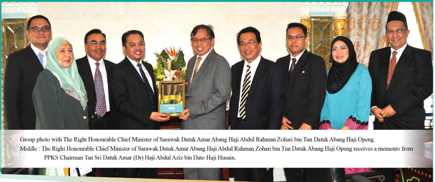
Group photo with The Right Honourable Chief Minister of Sarawak Datuk Amar Abang Haji Abdul Rahman Zohari bin Tun Datuk Abang Haji Openg.