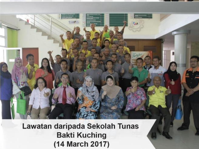
Lawatan daripada Sekolah Tunas Bakti Kuching (14 March 2017)