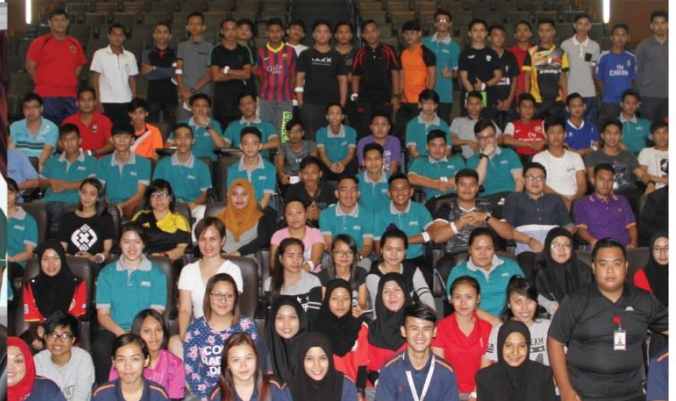
Minggu Suai Kenal (Ambilan Januari) (11 January 2017)