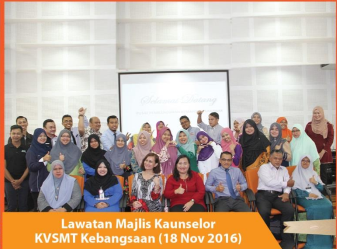
Lawatan Majlis Kaunselor KVSMT Kebangsaan (18 Nov 2016)