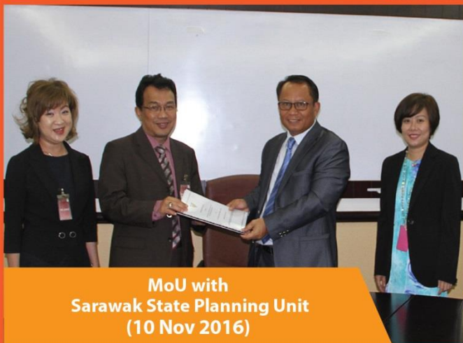
MoU with Sarawak State Planning Unit (10 Nov 2016)