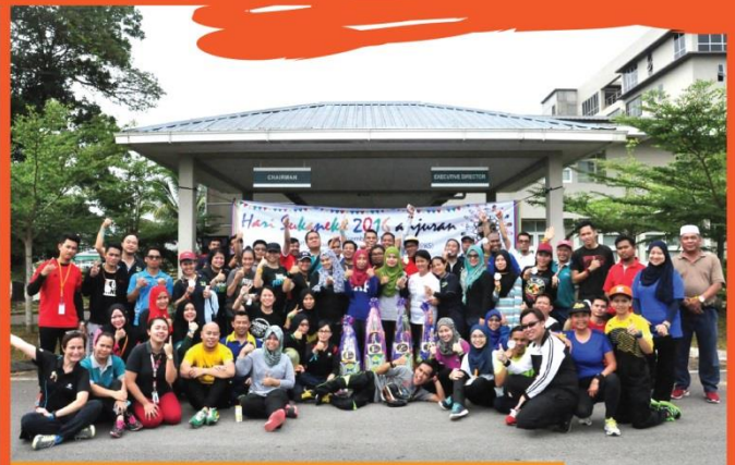
Hari Sukaneka Anjuran SRSC (9 Dec 2016)