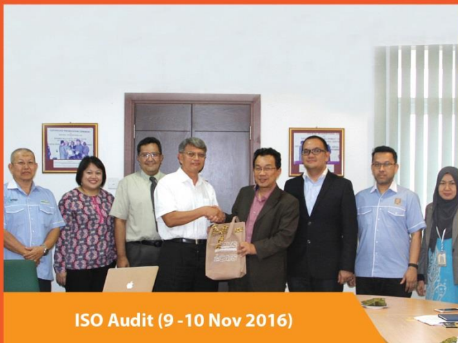
ISO Audit (9 - 10 Nov 2016)