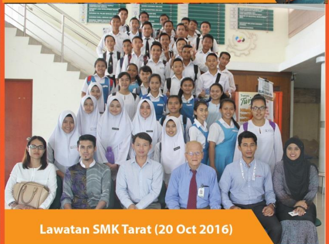
Lawatan SMK Tarat (20 Oct 2016)