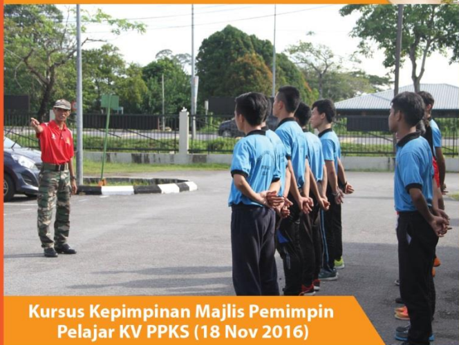
Kursus Kepimpinan Majlis Pemimpin Pelajar KV PPKS (18 Nov 2016)