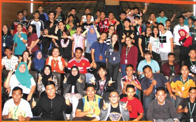
Majlis Orientasi Pelajar (21 Oct 2016)