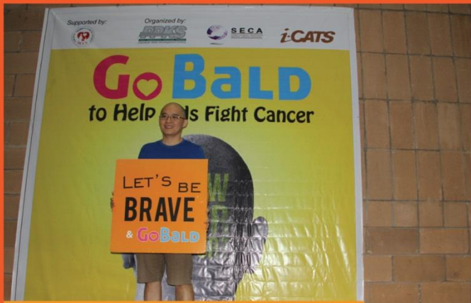
Go Bald (8 Oct 2016)