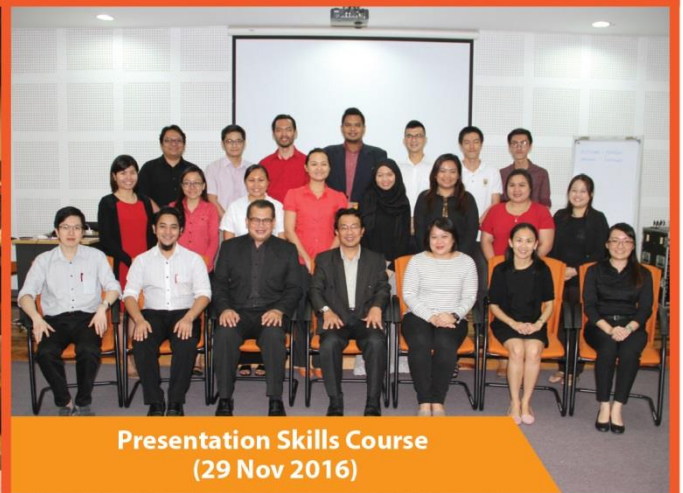
Presentation Skills Course (29 Nov 2016)