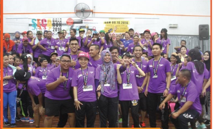
SECA Bald Run (9 Oct 2016)