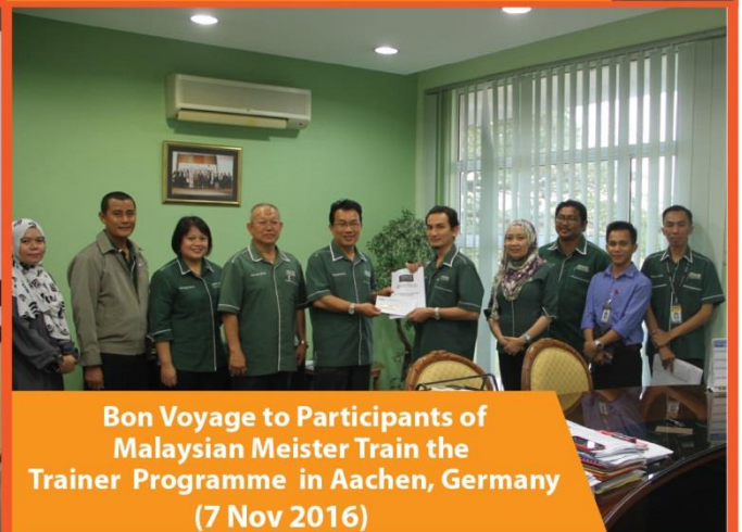
Bon Voyage to Participants of Malaysian Meister Train the Trainer Programme in Aachen, Germany (7 Nov 2016)