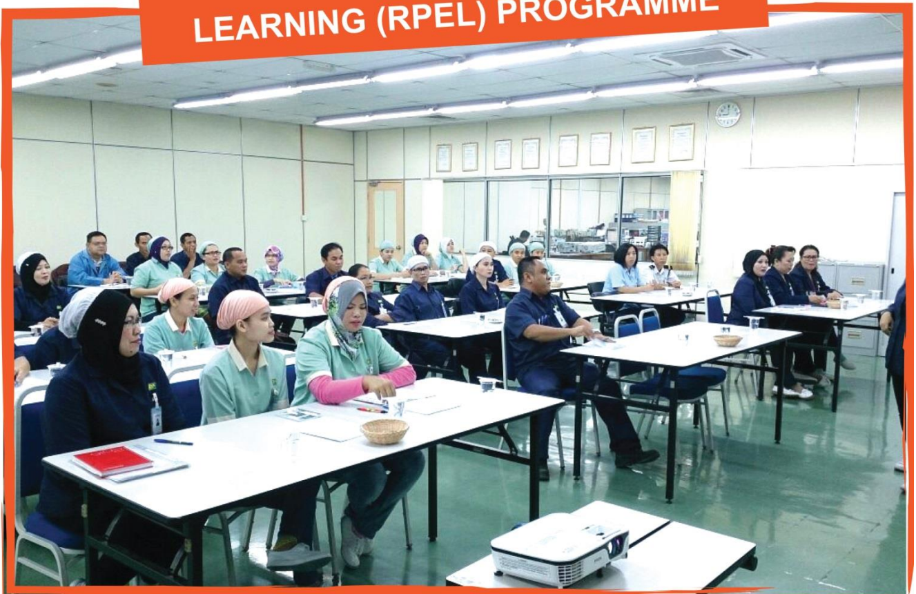
RPEL Briefing at TOKO Electronic (Sarawak) Sdn. Bhd.