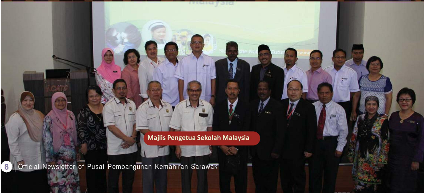
Majlis Pengetua Sekolah Malaysia