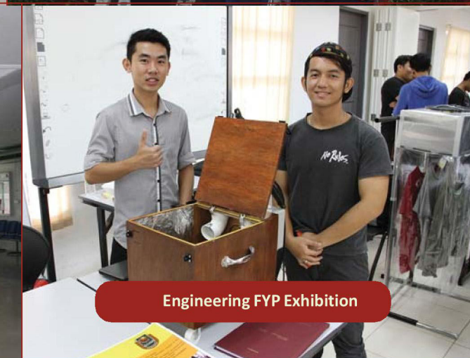
Engineering FYP Exhibition