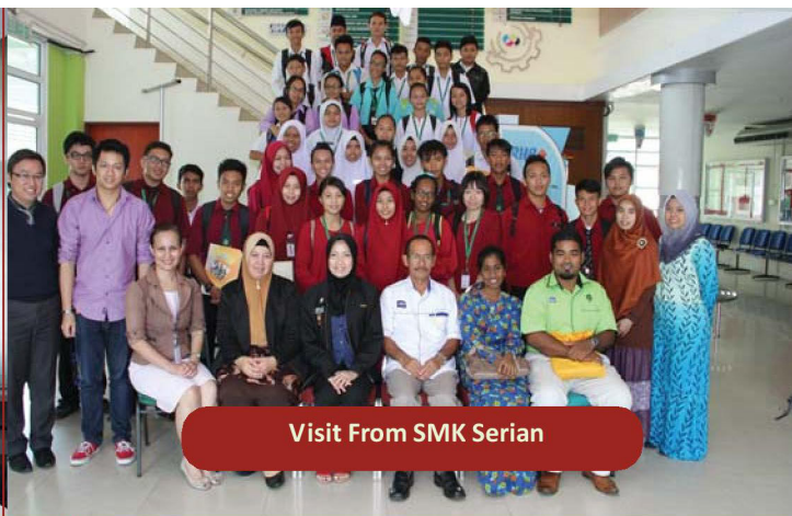
Visit From SMK Serian