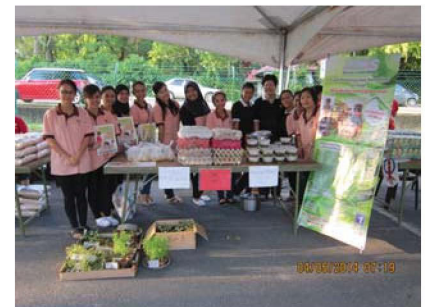
Group photo with lecturer

For the students, managing the stall during the Open Day Sale enabled them to gain an appreciation of the various skills needed such as planning, organizing and people skills. Indeed, amidst the sea of friendly competition, entrepreneurial flair and people skills went a long way in promoting the various products during the event. Proceeds from the sale were donated to PERKATA.