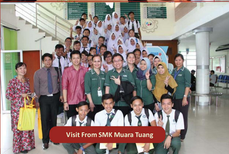
Visit From SMK Muara Tuang