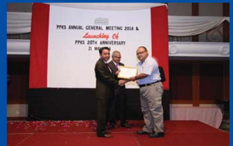
KKB Engineering Berhad