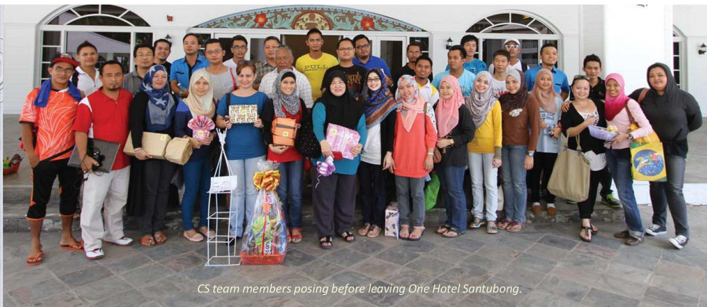
CS team members posing before leaving One Hotel Santubong.

The Corporate Services Department has organized a short staff retreat on 13 and 14 June 2014. Held at One Hotel, Santubong, the programme has been attended by 41 staff of the Corporate Services Department. The programme kicked off on Friday morning at Rumah Seri Kenangan, Kota Samarahan where all CS staff fulfilled their social obligation for a CSR programme. After the programme ended, the group continues their journey to One Santubong Hotel for the staff retreat.