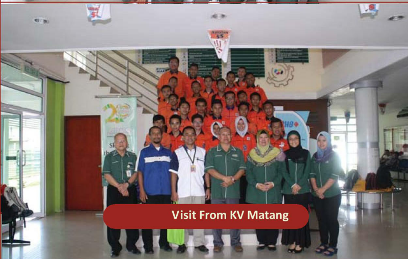
Visit From KV Matang