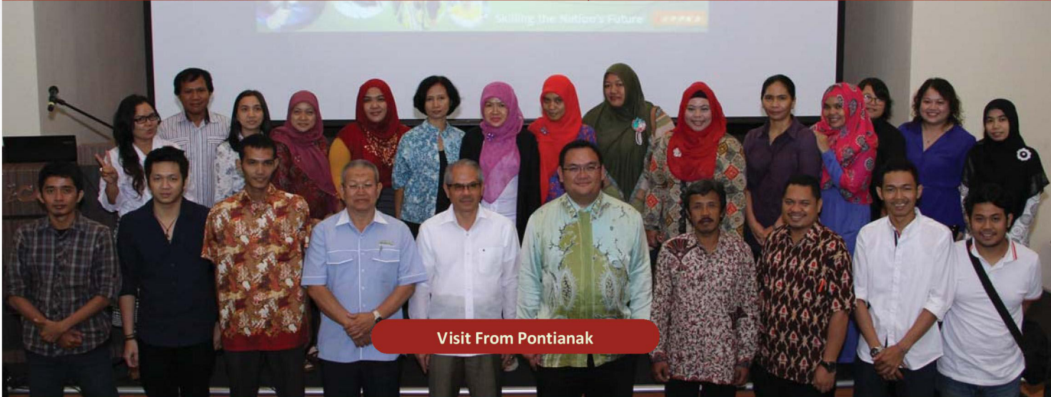
Visit From Pontianak