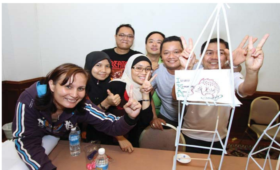
The overall champion group 'Ikan' during one of the competition