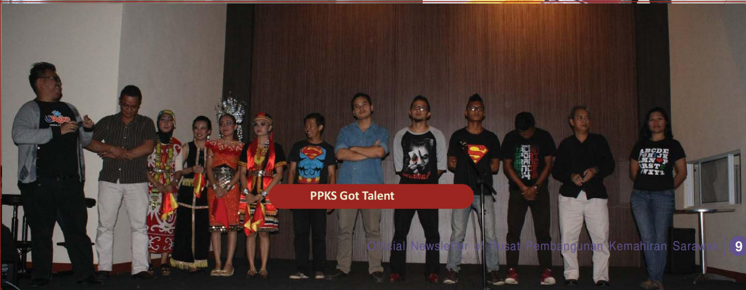
PPKS Got Talent