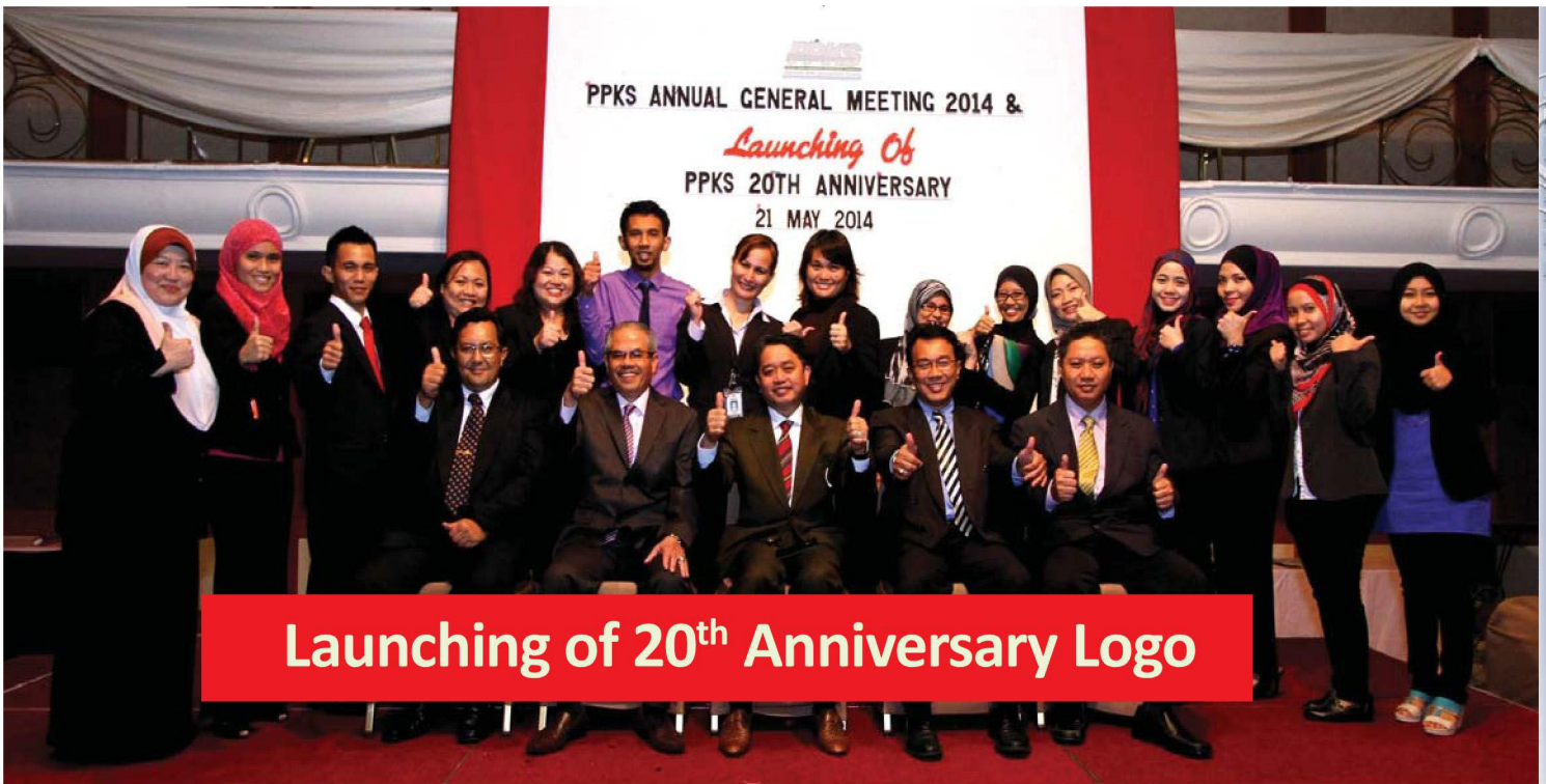
The management team and organizing committee pose for a group photo.

In conjunction with the 20 th Anniversary Celebration, Pusat Pembangunan Kemahiran Sarawak has launched its official logo to mark the 20 th Anniversary celebration. The event was held on 21 May 2014 at Riverside Majestic Hotel. The ceremony was a kick off for month long activities that has been scheduled throughout the year.