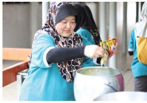
Preparing lunch for the elderly.