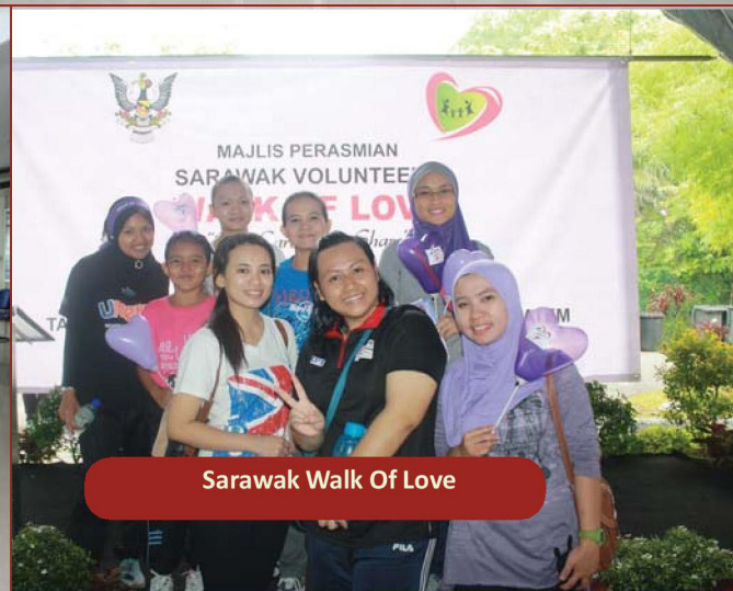
Sarawak Walk Of Love