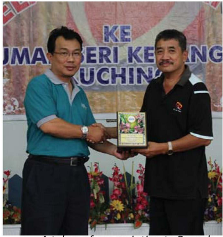
A token of appreciation to Rumah Seri Kenangan