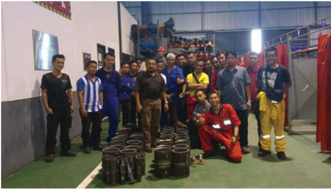
After the exam, happy moment! Posing for a group photo with the examiner from INSTEP after completion Petronas Advance Welding Certificate Training.

Industrial standard and job-specific skills complemented with theoretical training had enable AWISAR to produce excellent development potential workforce for these companies.