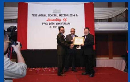
Serba Dinamik Sdn Bhd