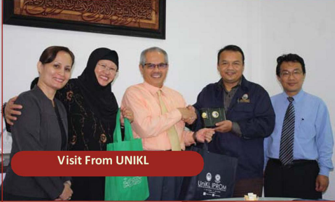
Visit From UNIKL