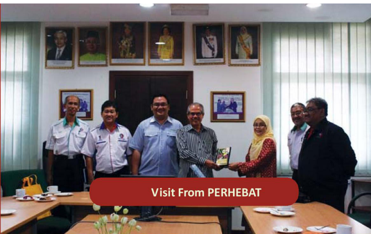
Visit From PERHEBAT