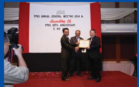
Sarawak Information Systems Sdn. Bhd