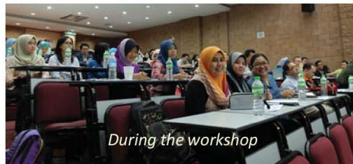
During the workshop

meaningful event. Organized for two days from 24 until 25 May 2014, the workshop aimed to expose participants with the concepts, philosophies and principles of OBE as well as why or how OBE should be implemented in higher learning education, as urged in the government's policies and