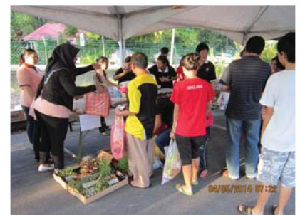
Students entertaining guest