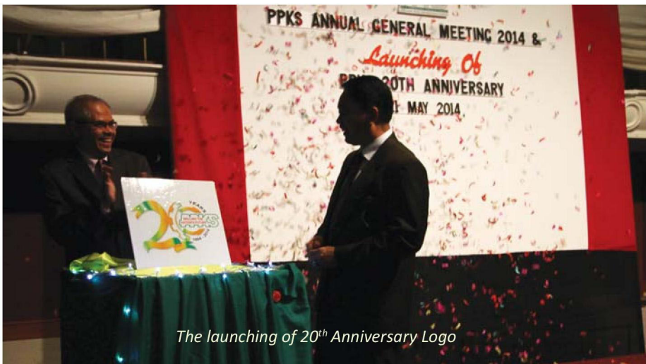
The launching of 20 th Anniversary Logo