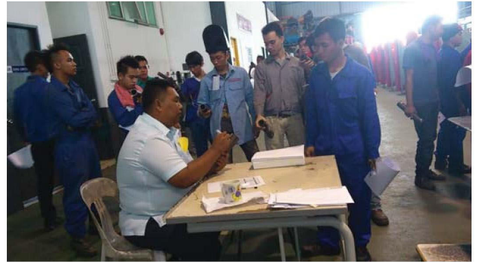
Welding Level 3 students were being assessed by External Examiner of Jabatan Kemahiran Malaysia (JKM) during final practical examination