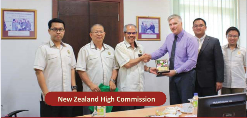
New Zealand High Commission