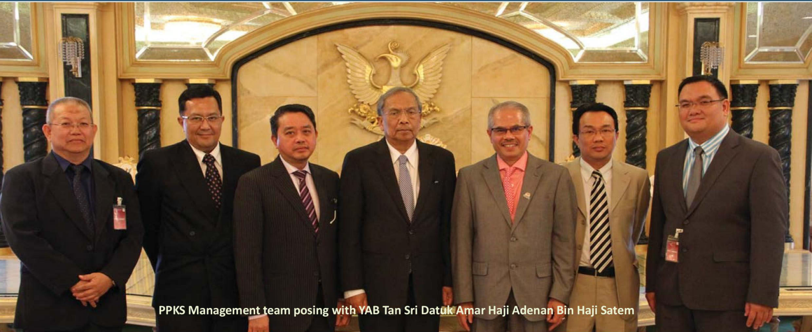
PPKS Management team posing with YAB Tan Sri Datuk Amar Haji Adenan Bin Haji Satem