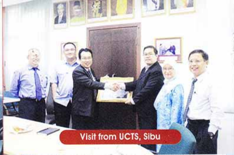
Visit from UCTS, Sibul