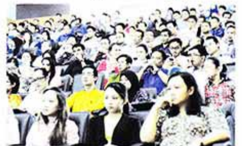
Staff of PPKS/i-CATS listen attentively to strategic initiative for 2014/2015 by PPKS's Executive Director.

total of 90 staff members, including our colleagues from PPKS branches and subsidiaries, received the certificate of appreciation. 🌐