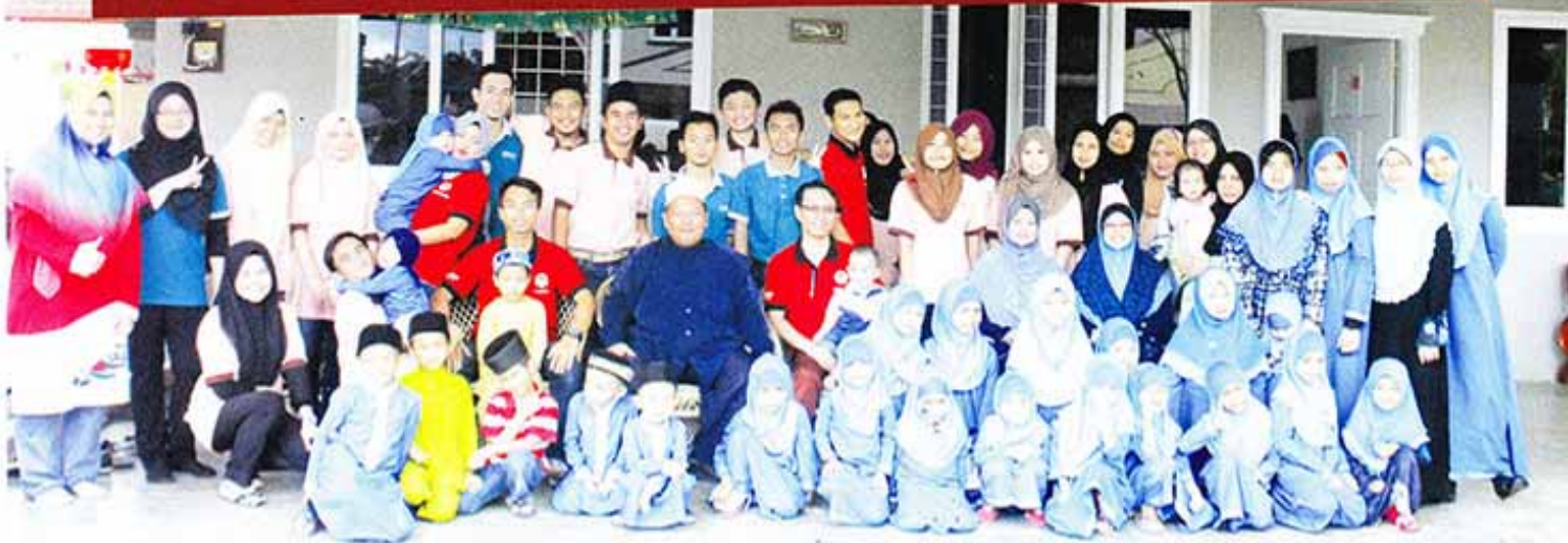
Group photo students of PPKS/i-CATS with the children of Rumah Amal Seri Murni

O n 15 February 2014, a group of students from the Students' Representatives Council and Muslim Students Association of PPKS/i-CATS visited Rumah Amal Seri Murni located near Batu Kawa, Kuching. Coordinated by the Student Affairs Unit of the Registrar's Office, the purpose of the visit was to instil in the students, a sense of community and the importance of teamwork in facilitating the noble cause of service to humanity. The visit