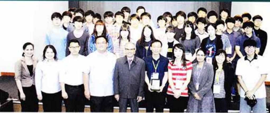
The management of PPKS with the Korean students