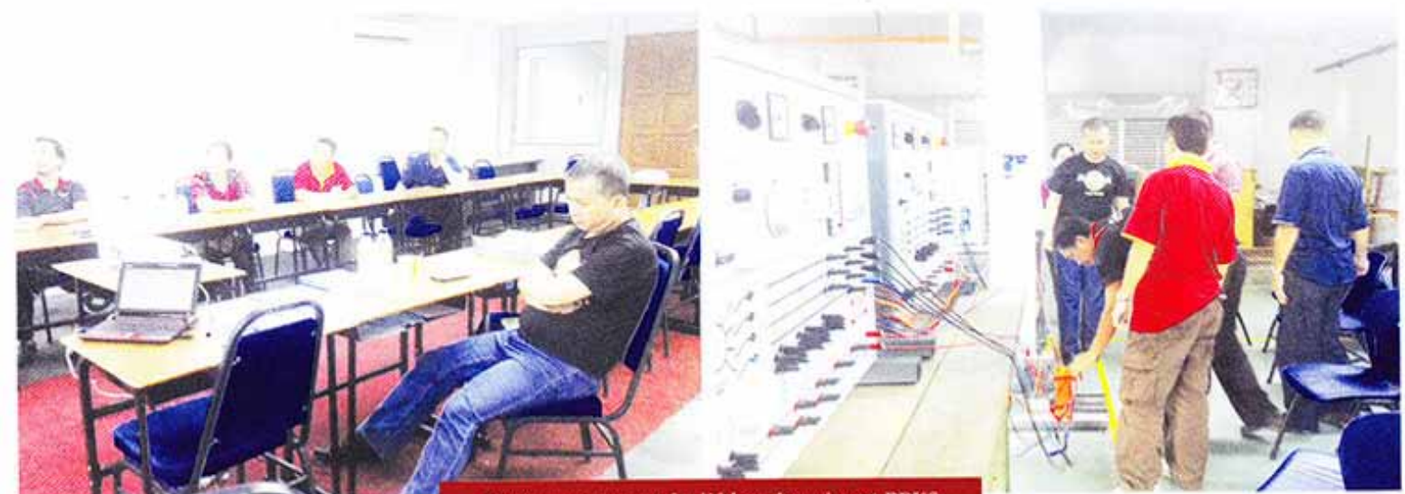
Study environment for lifelong learning at PPKS