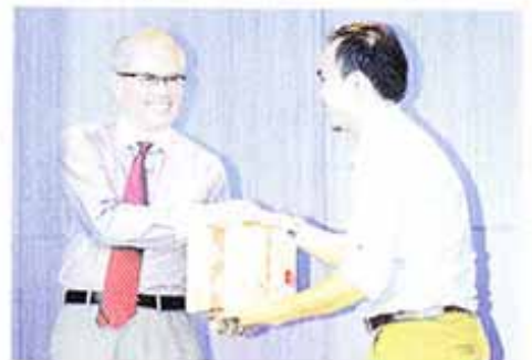
The newlywed received gift from Dato Haji Baharudin