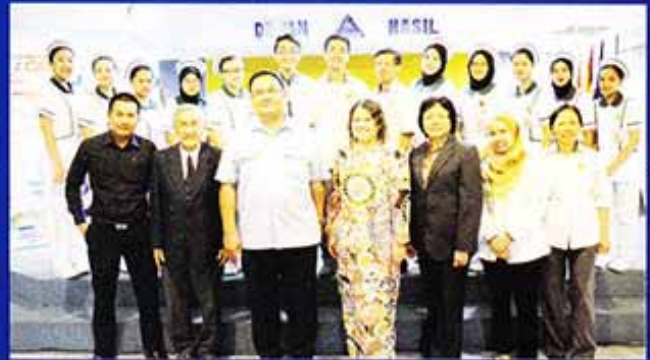
Staff and student of i-CATS posing for group photo

On 13 February 2014, as part of its ongoing effort to foster awareness about preventive health care, the International College of Advanced Technology Sarawak (i-CATS) organized a Health Talk and Screening programme for staff of the Inland Revenue Board (Lembaga Hasil Dalam Negeri).