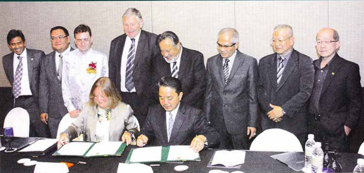
The signing ceremony of the Memorandum of Cooperation between i-CATS, Malaysia and SIT, New Zealand at the Hilton Kuching

The signing of a Memorandum of Cooperation (MoC) on 22 March 2014 between the International College of Advanced Technology Sarawak (i-CATS) and the Southern Institute of Technology (SIT), Invercargill, New Zealand is indeed a significant milestone for both institutions in their quest to equip students with the relevant knowledge and skills to thrive as productive members of the workforce.