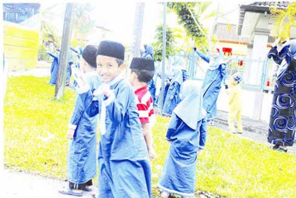
A happy face!

cleaning and painting. The students also entertained the children with a number of dance performances. During the visit, the students took the opportunity to present Madam Khadijah with various foodstuff and kitchen supplies.