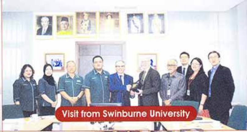
Visit from Swinburne University