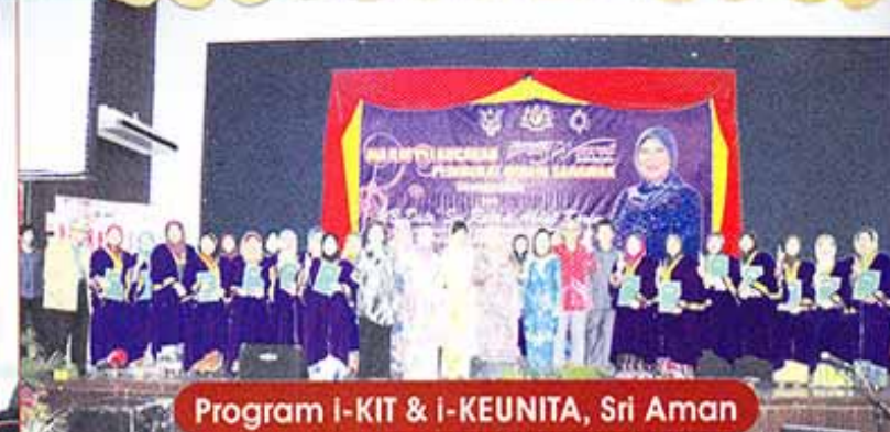
Program I-KIT & I-KEUNITA, Sri Aman