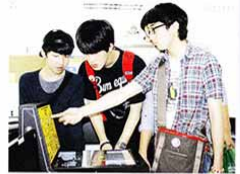
Tour to the facilities

The New Year got off to a good start with PPKS opening its doors of welcome to visitors from Suwon Hi-Tech High School, Korea. Comprising high school students accompanied by their teachers, the first group of 44 students and 3 teachers visited PPKS Kuching campus on 7 January 2014, followed by a second group of 21 students and 4 teachers on 22 January 2014.