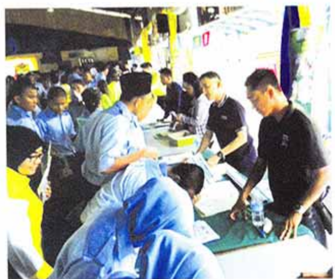
Staff of PPKS Miri attend to queries and requests from students at the booth

For the trainees, the TVET Day was an eye-opener as it served as an introduction to the world of technical and vocational education, and the prospect of gainful employment within Malaysia and distant shores.