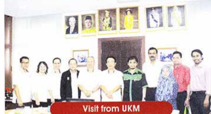
Visit from UKM