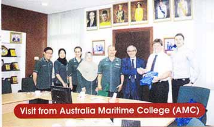
Visit from Australia Maritime College (AMC)