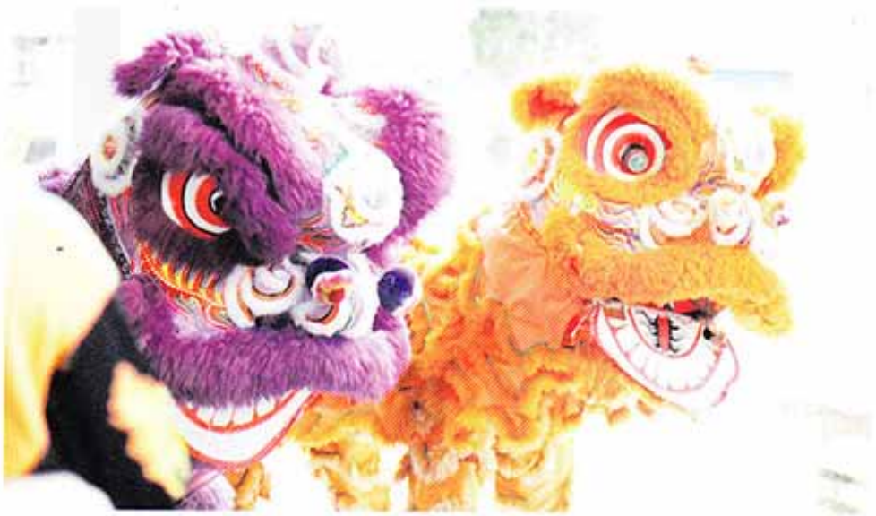
The Chinese New Year celebration 2014