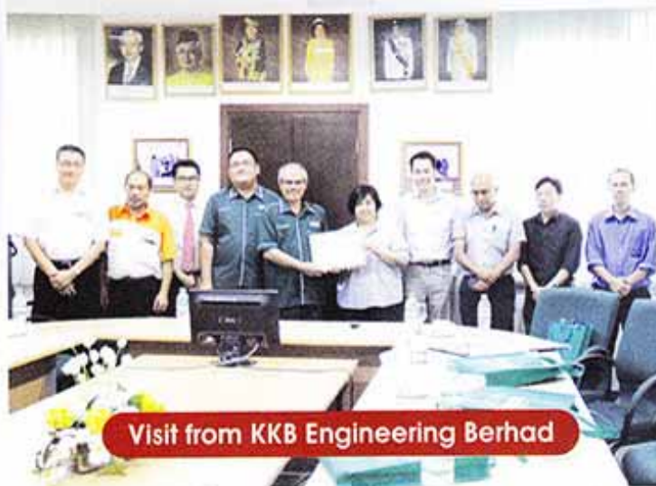
Visit from KKB Engineering Berhad