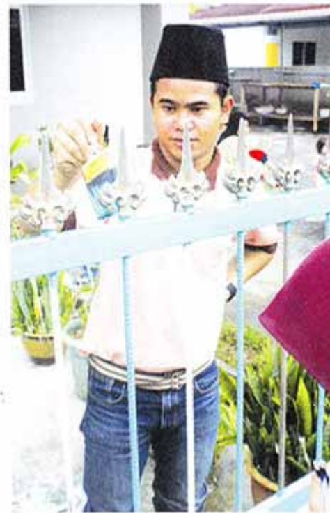
One of PPKS/i-CATS's students painting the fence

On arrival, the students participated in various activities such as