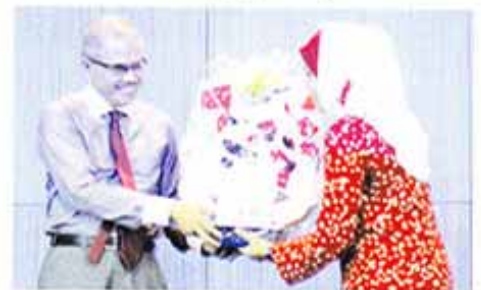
Congratulation on your newborn!