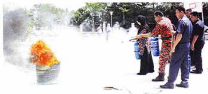
Demonstration of the correct way to use a fire extinguisher by officers from Fire and Rescue Department