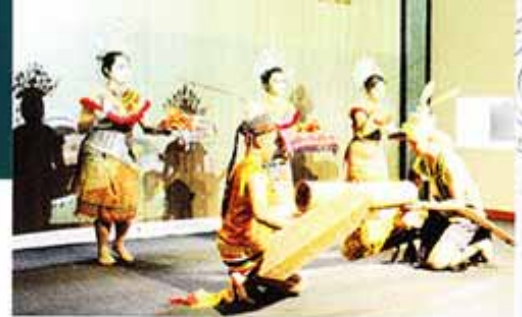
Cultural performance by Kelab Serindang Seri Tari