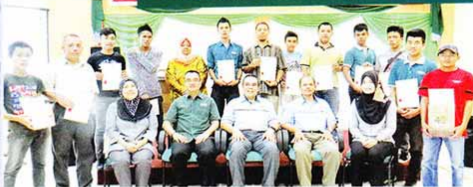
Group photo of the participants with PPKS and STIDC staff

With a view to fostering an appreciation of wood carving among youths, Sarawak Timber Industry Development Corporation (STIDC) in collaboration with PPKS Mukah organized a 3-day wood carving appreciation course (Kursus Apresiasi Seni Ukiran Kayu) from 25 to 27 February 2014.