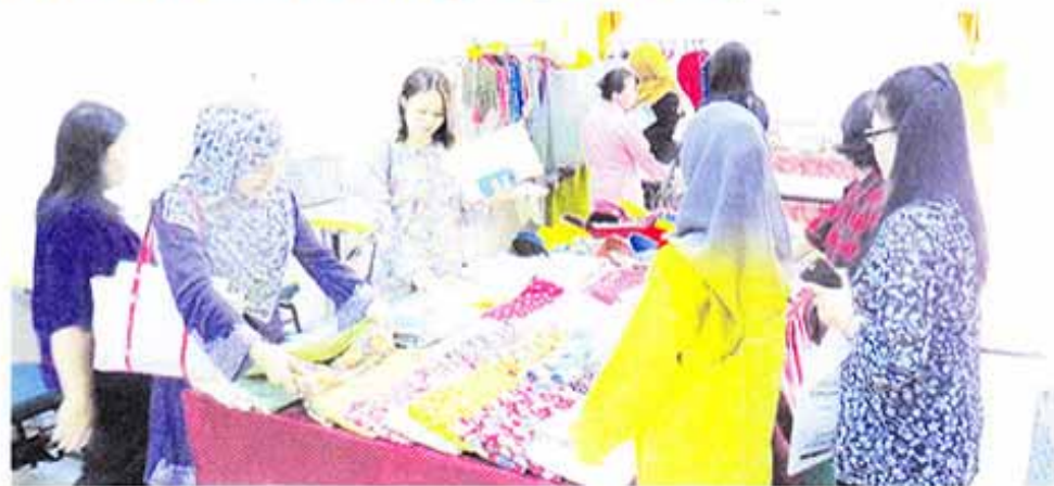
Visitors visit one of the booths during the Open Day

During the Open Day, the students were also exposed to the finer points of professional presentation and gained an appreciation of the various aspects of entrepreneurship as they promoted their creations and interacted with members of the public. It was also