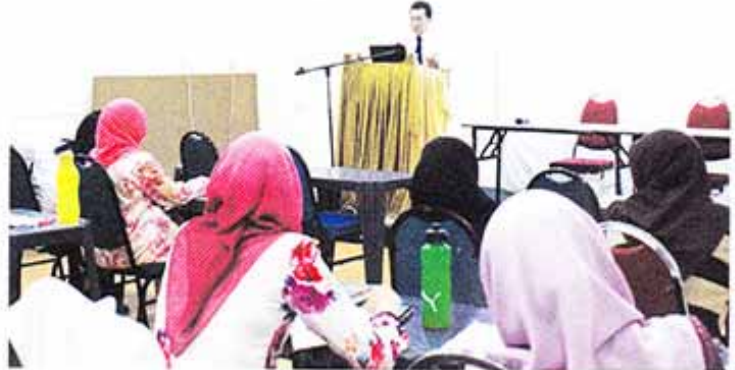
Briefing by Chief Financial Officer