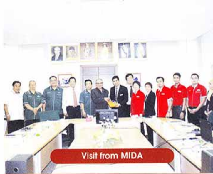
Visit from MIDA