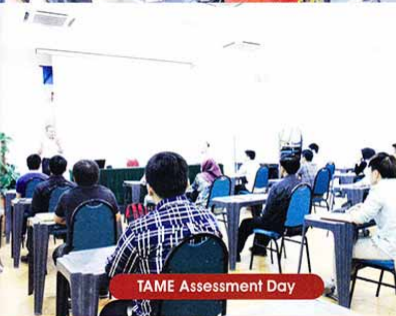
TAME Assessment Day