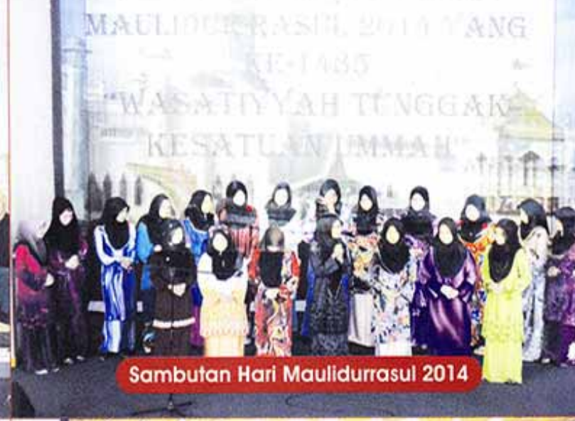
Sambutan Hari Maulidurrasul 2014