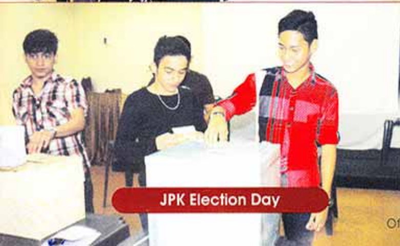
JPK Election Day