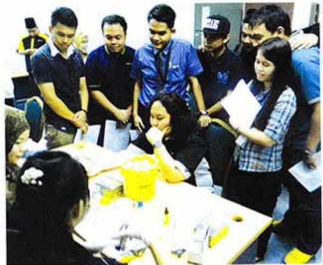
Staff and students of PPKS Miri give full support to the campaign

At PPKS/i-CATS, staff and students are aware of the importance of donating blood on a regular basis. The next Blood Donation Campaign is planned for August 2014 followed by another campaign before the end of the year.