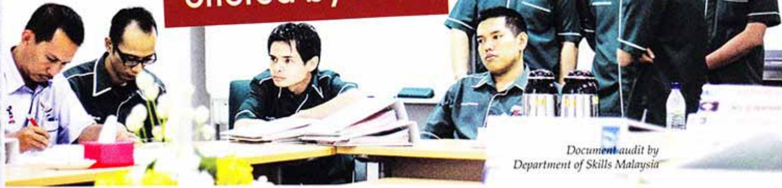
Document audit by Department of Skills Malaysia