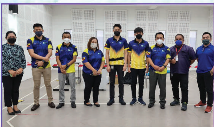
"ONE STEP CLOSER" Peringkat Pra Kelayakan Pertandingan Worldskills Malaysia Belia (WSMB) Tahun 2022 dan Pameran Projek Akhir Pelajar Tahap 4 Elektronik Industri. (23 June 2022)