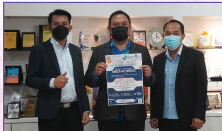
Fully Funded Training Programmes Under Yayasan Peneraju Pendidikan Bumiputera. (19 May 2022)