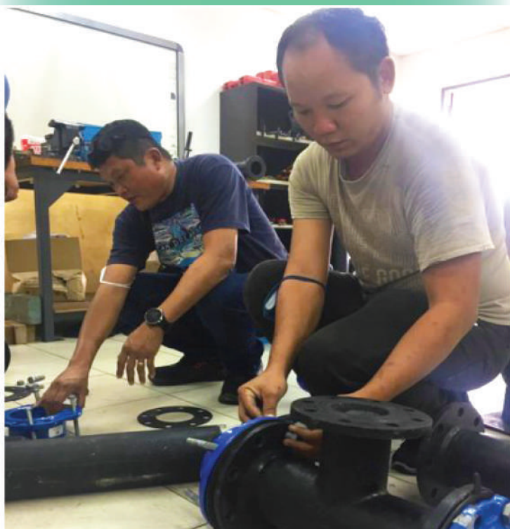
Mains Layer Programme. (13 - 17 June 2022)