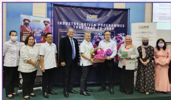
Meeting Between the Social Welfare Department of Sarawak (Jabatan Kebajikan Masyarakat Sarawak) and Sarawak Skills Chaired by YB Encik Mohamad Razi bin Sitam, Deputy Minister of Community Wellbeing Development. (20 June 2022)