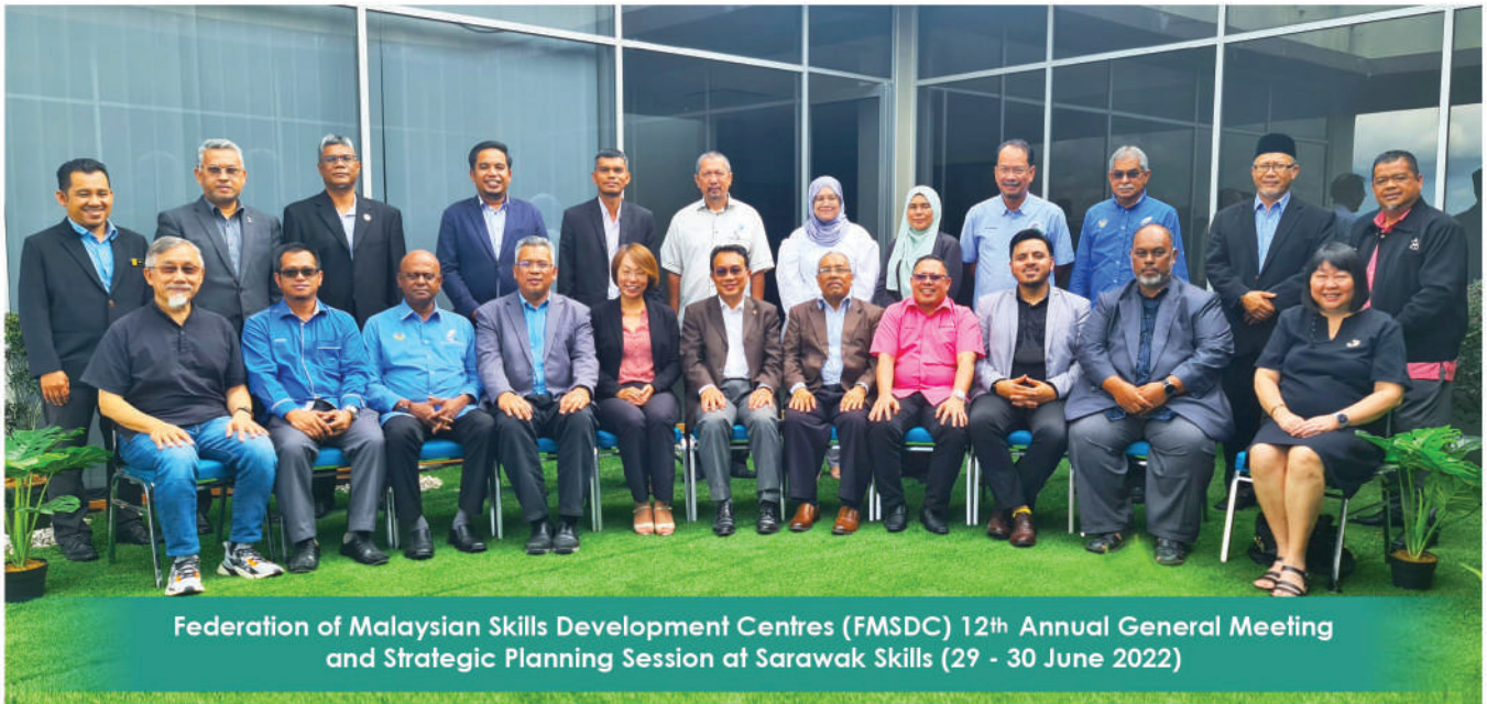
Federation of Malaysian Skills Development Centres (FMSDC) 12 th Annual General Meeting and Strategic Planning Session at Sarawak Skills (29 - 30 June 2022)