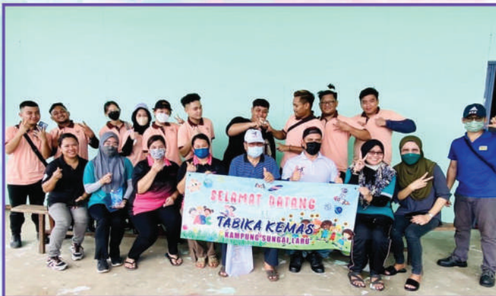
Community Service Responsibility (CSR) Programme at Tadika Kemas, Kpg Sungai Laru, Tabuan, Organized by Sarawak Skills Student's Services Department. (14 May 2022)