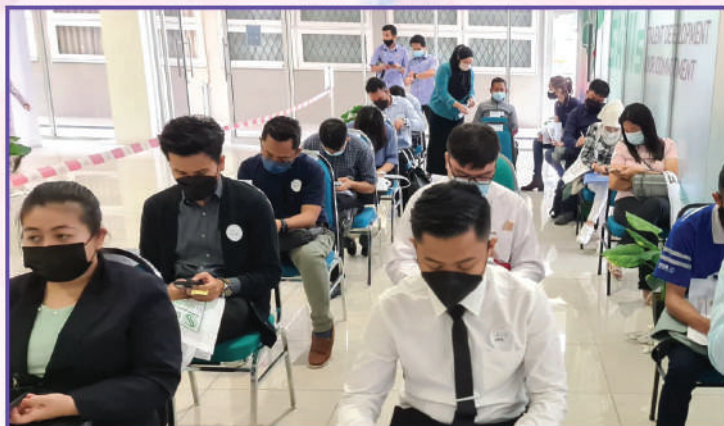
"Temu Duga Khas Belia" Organized by Sarawak Skills & PERKESO. (25 April 2022)