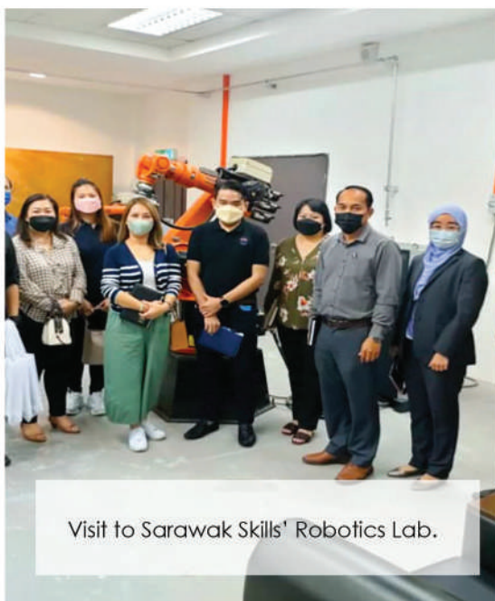
Visit to Sarawak Skills' Robotics Lab.