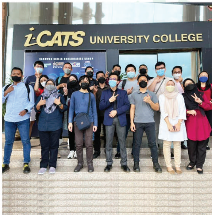
AutoCAD Level 2 (Intermediate) Course. (21 - 23 June 2022)