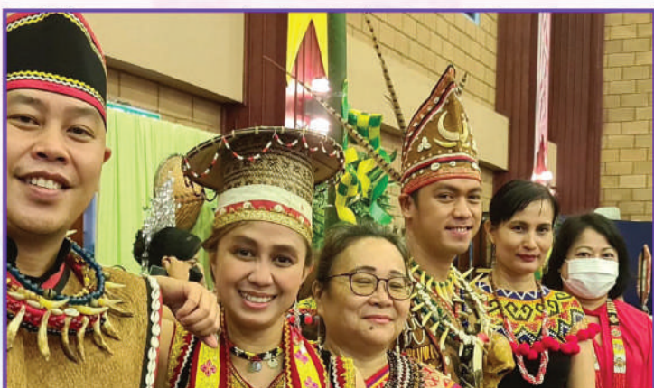
Majlis Ramah Tamah Aidilfitri dan Gawai Dayak Sarawak Skills 2022. (26 May 2022)