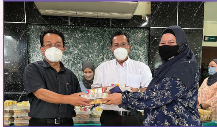
Nasi Arab Mandy Distribution Programme Organized by Sarawak Skills Surau Darul Ilmi Committee. (22 April 2022)