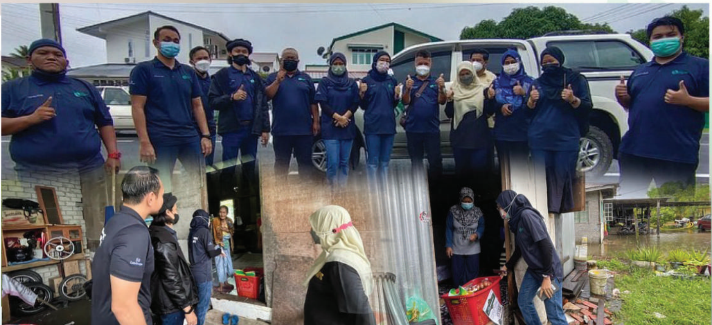
Tautan Kasih Syawal: This is a yearly end of Ramadhan activity with the aim to share contributions in the form of food and money with asnaf and poor families living close to SS/i-CATS Miri. Contributions came from all staff members as well as the public. Food baskets and money were distributed to provide some relief to the aid recipients trying to make ends meet for the coming Eid Aidil Fitri. As responsible corporate citizens, SS/i-CATS Miri staff members continue to serve the community in Lutong and surrounding areas and we take the opportunity to continue the tradition especially in the blessed days of Ramadhan.