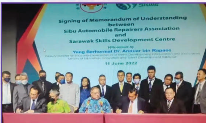
Memorandum of Understanding Signing Ceremony Between Sibu Automobile Repairers Association (SARA) and Sarawak Skills. (11 June 2022)