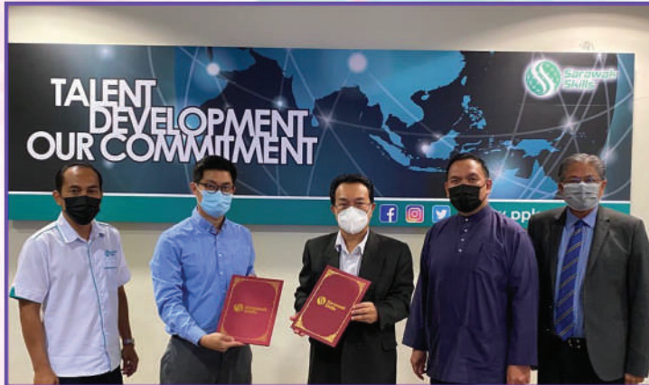
Exchange of Memorandum of Understanding (MoU) Between Sarawak Skills and Mutiara Jayateknik Engineering Sdn. Bhd. (29 April 2022)