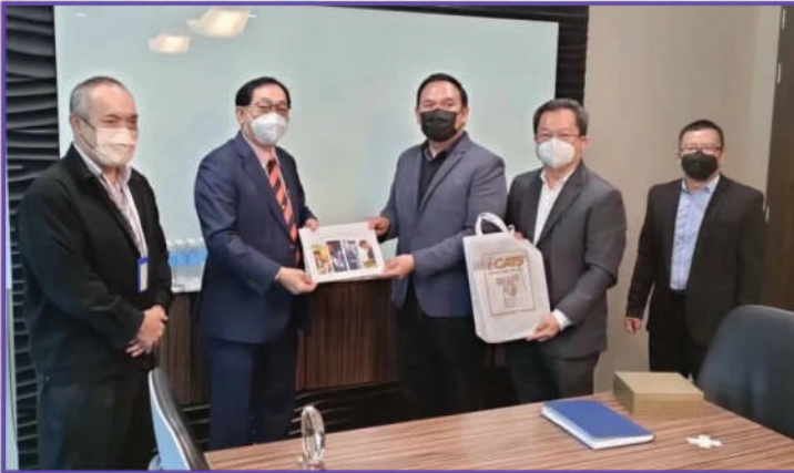
Courtesy Call on YB Datuk Francis Harden Hollis, Deputy Minister for Education, Innovation and Talent Development II (Talent Development). (12 April 2022)