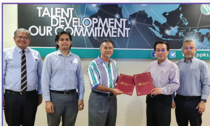
Exchange of Memorandum of Understanding (MoU) Between International Institute of Plantation Management (IIPM) and Sarawak Skills. (9 June 2022)