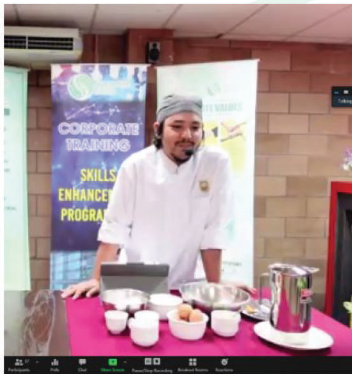
Siew Mai & Chicken Wantan with Sambal (Kicap & Cheese Pedas) for Jabatan Wanita & Keluarga Sarawak Through Online Zoom. (7 June 2022)